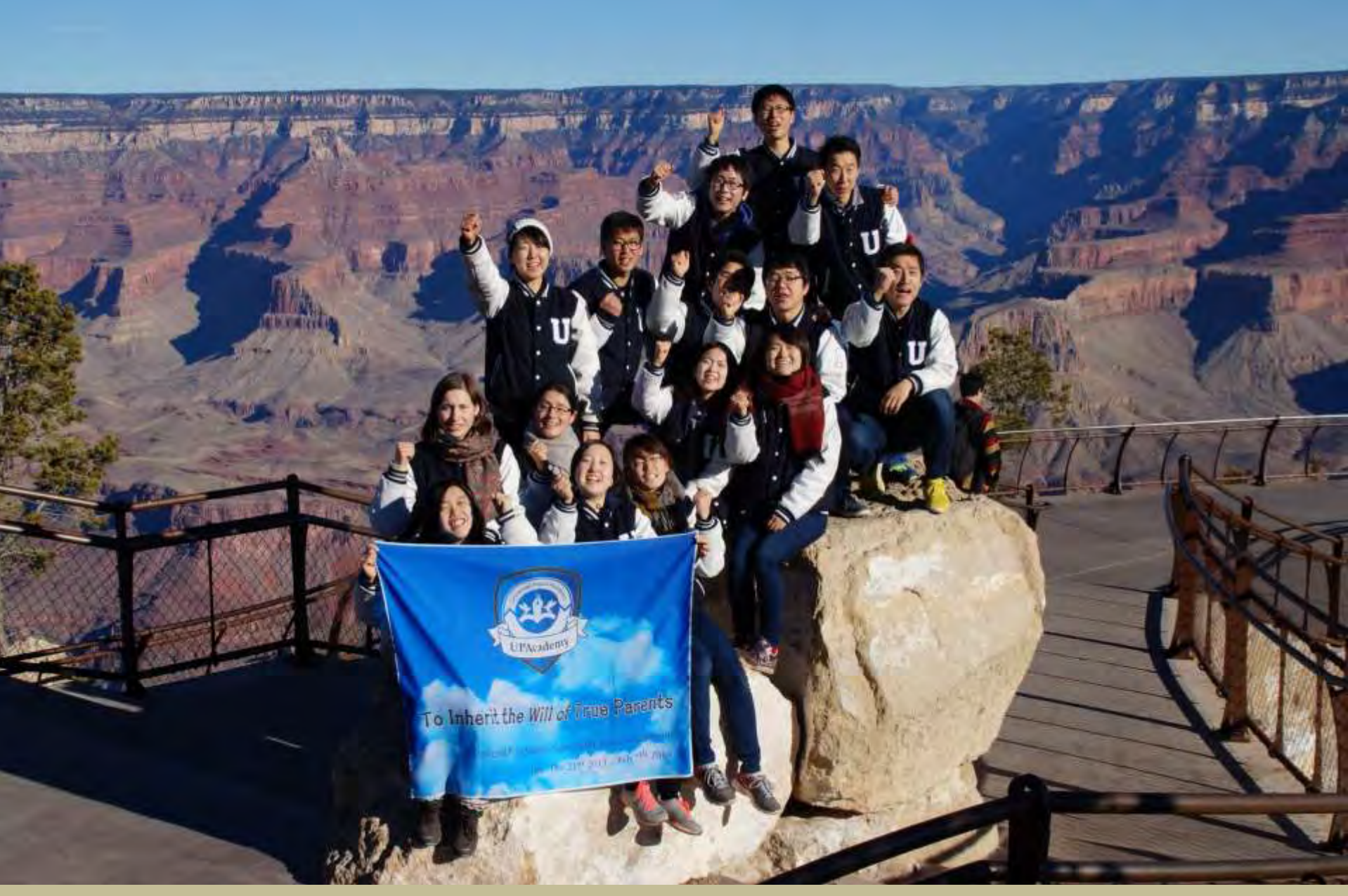
Pilgrimage to Overseas