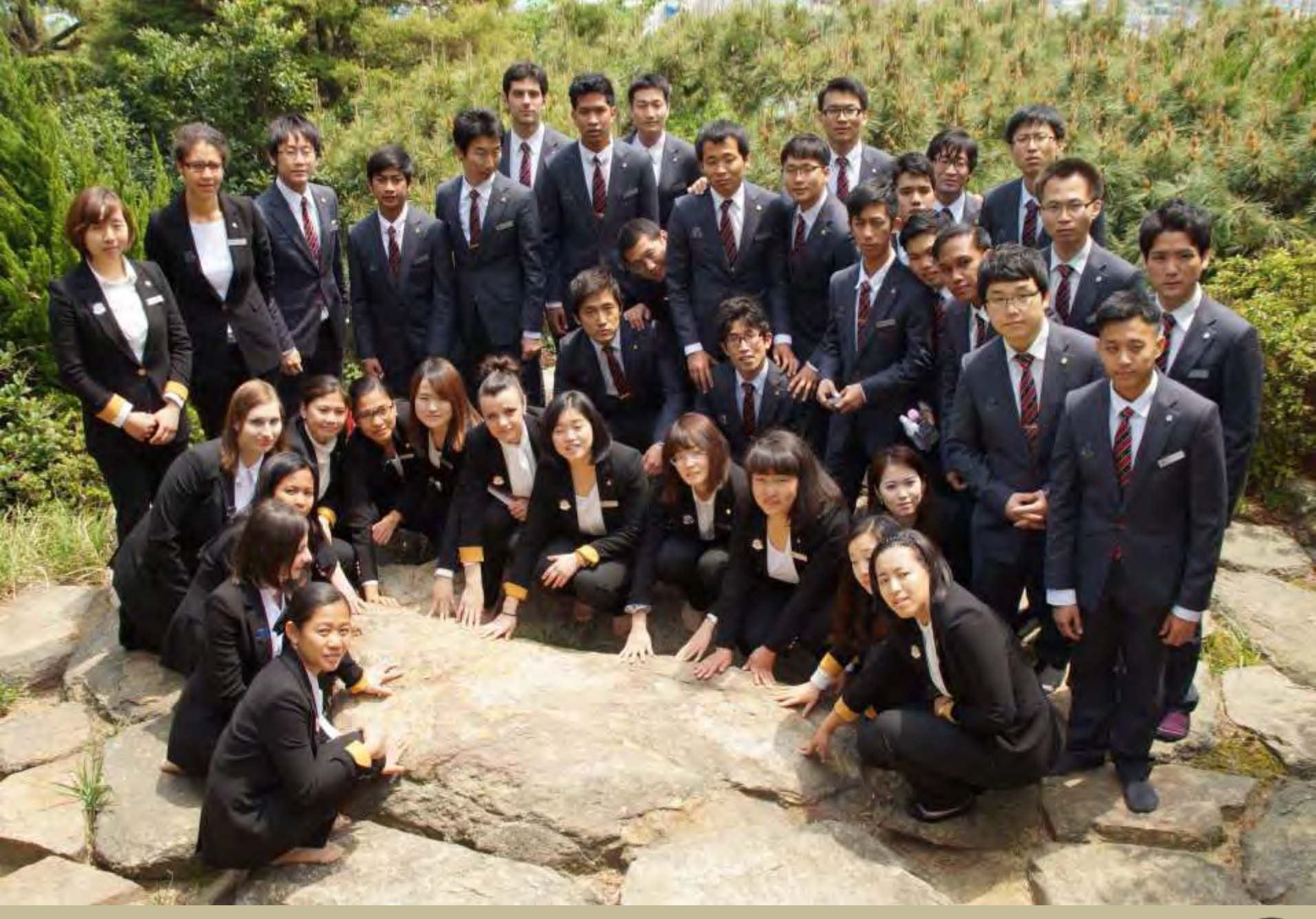
Visit to Holy Sites