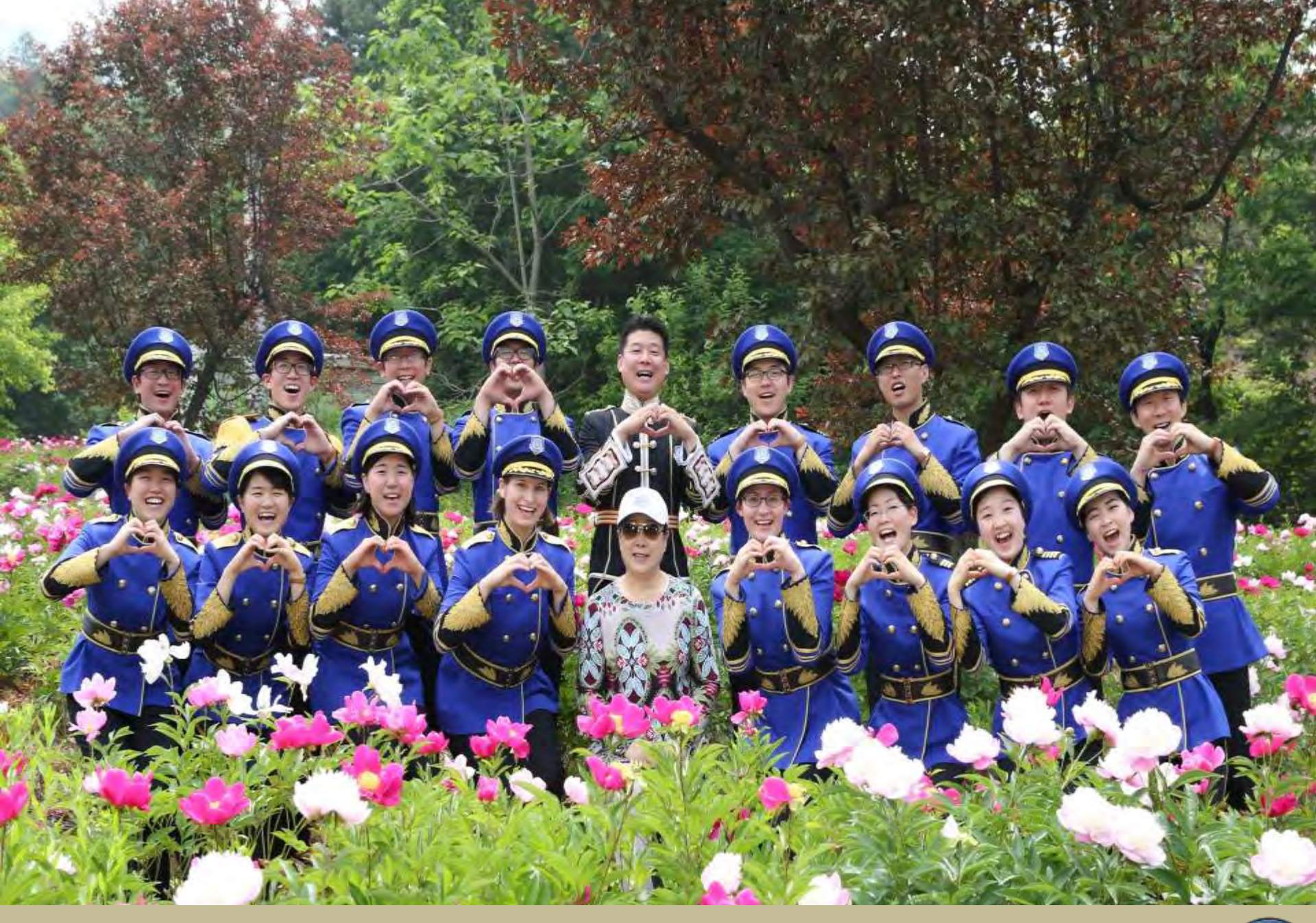
UPA Special Meeting with True Mother