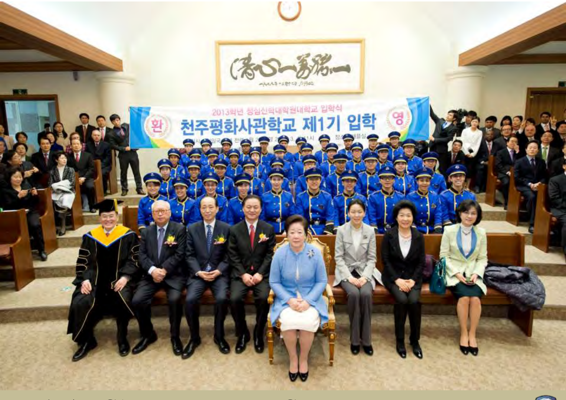
UPA 1st Class Entrance Ceremony