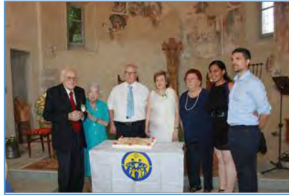
Three generations together

Furthermore, on the same day we organized a Ceremony of Grace for one of our elderly mothers, who could not attend before this date because of health reasons; it truly was a special time, she is 81 and lives quite near the monastery.