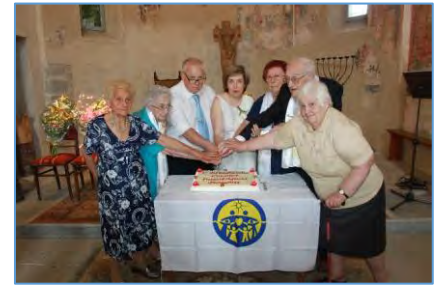
Cutting the cake

The nuns and their staff prepared a special luncheon, with healthy food prepared with the vegetables from their garden, while Family Federation members offered juices and biscuits.