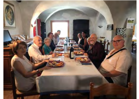
The table with the new Blessed couples

We are truly grateful to our Heavenly Parents and our beloved True Parents. We could taste a glimpse of the Cheon il Guk as "One Family under God".