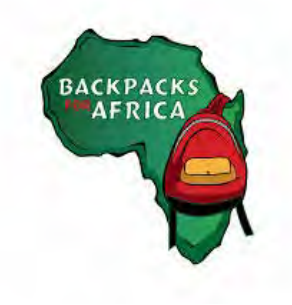
Backpacks for Africa