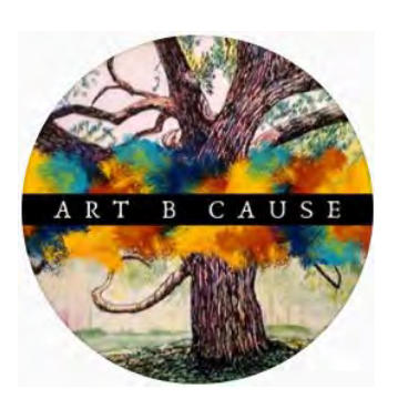
Art B Cause