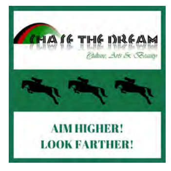
Chase the Dream Culture, Art...