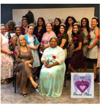
A Secret Place Ministries