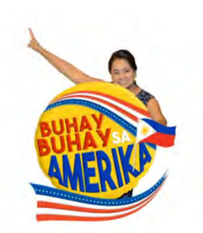
Buhay Buhay Sa Amerika