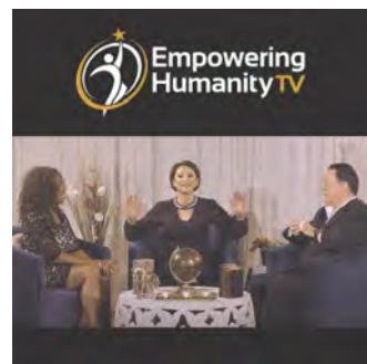
Empowering Humanity TV Sh...