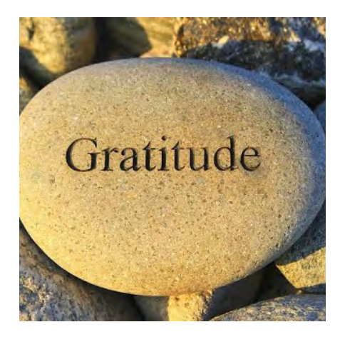
How we live each day Read More \rightarrow Nov 21, 2020