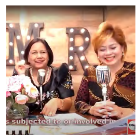
Recent Highlights from our Global Friend, Buhay Buhay sa Amerika