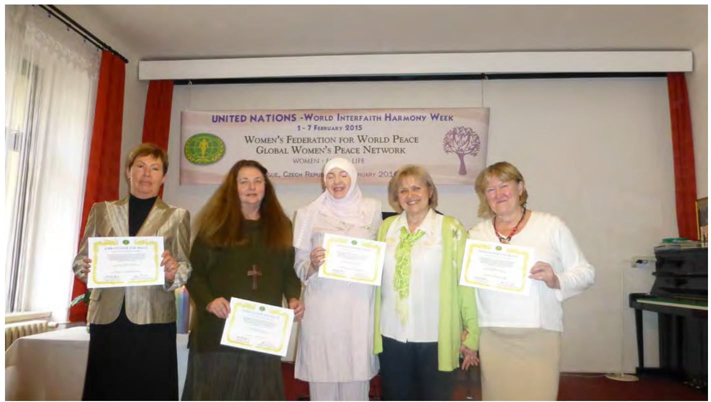
Newly appointed Ambassadors for Peace

After the lunch four new Ambassadors for Peace were appointed.