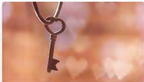
The importance of saying "I love you" during COVID-19