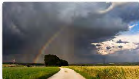
Effective ways of dealing with the grieving process