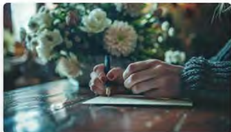
Guidance on Writing Sympathy Cards