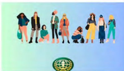
WFDP Denmark/Sweden - Invest in women: Aceletat...