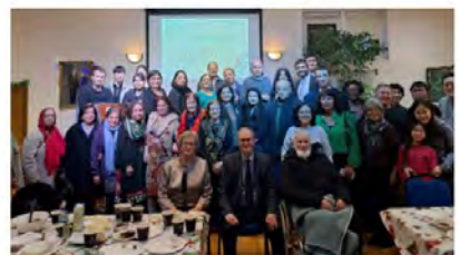
WFDP UK -Christmas Celebration event 2023