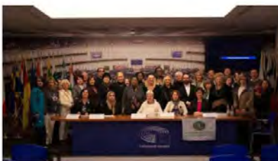
WFDP Italy - WOMEN OF FAITH AND THEIR...