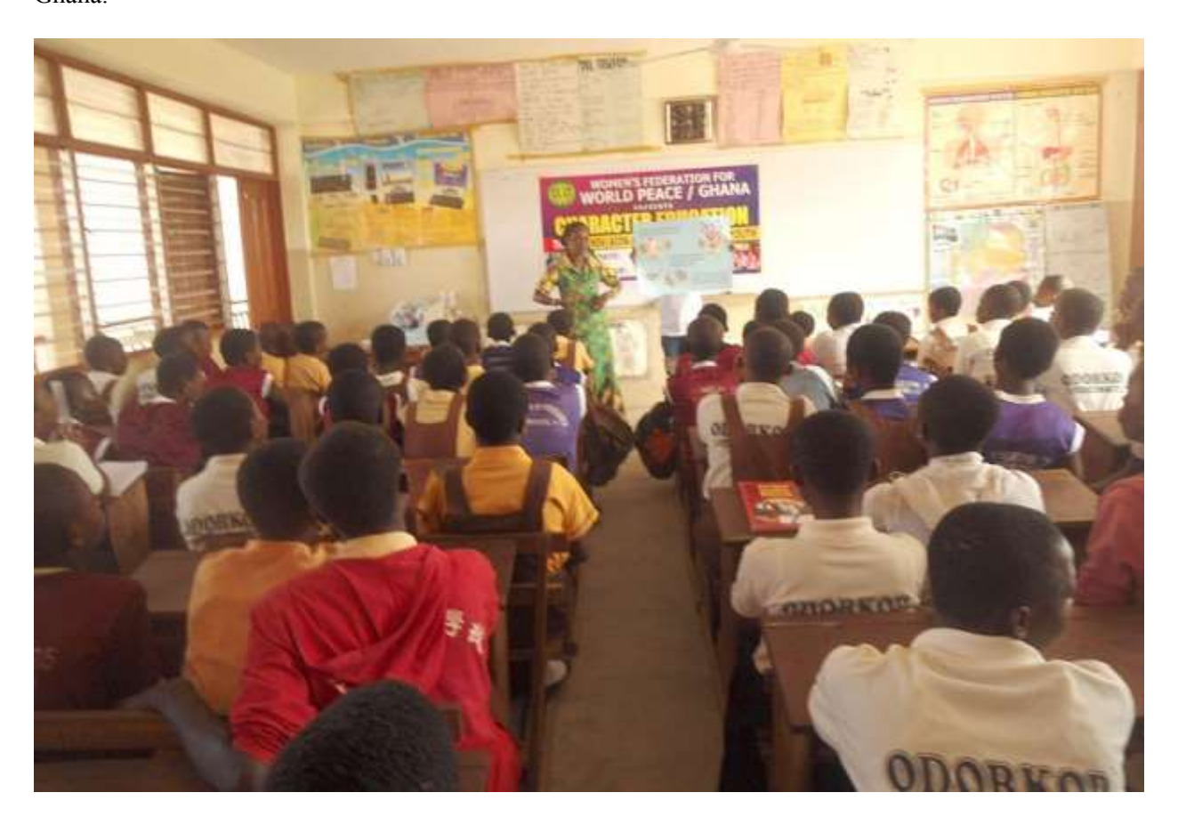
In all, during June 2017, WFWP –Ghana impacted the lives of 655 students in four schools in Accra, Ghana.