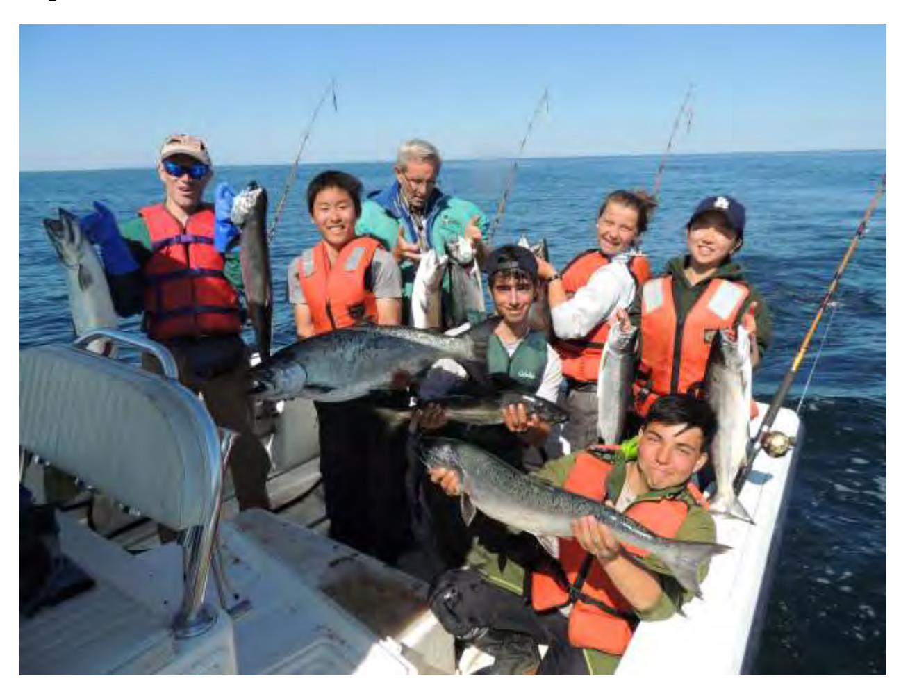
In Kodiak, Alaska, the Seventh National Ocean Challenge Program (NOCP), which took place from July 12 to August 1, 2015, has come to a successful conclusion.