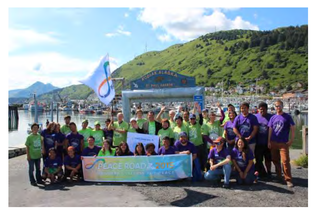
By 2015 Kodiak had become "THE destination" for young Unificationists not only to receive top-level ocean-based training but also to connect with True Parents' heart and vision for the Ocean Providence. Participants learn why True Parents love Alaska so much, and why Kodiak is key to the successful dispensation of the Pacific Rim Providence. In addition, they learn Divine Principle and get opportunities

Therefore, in 2009 a team of early pioneers trained by True Father came together centering upon Kodiak, Alaska, and determined to restart and create a world-class program focused primarily on the development of Unification-born teenagers and young adults, and the National Ocean Challenge Program (NOCP) was born. With little money but a strong commitment to ownership, the team brought young Unificationists from all over America, and each year the program grew in quality and quantity. Gradually individual, family and company donors began to contribute to help out. Soon thereafter, True Parents' Ocean Peace company stepped up to help start a scholarship program for youth due to the costs to travel to Kodiak.