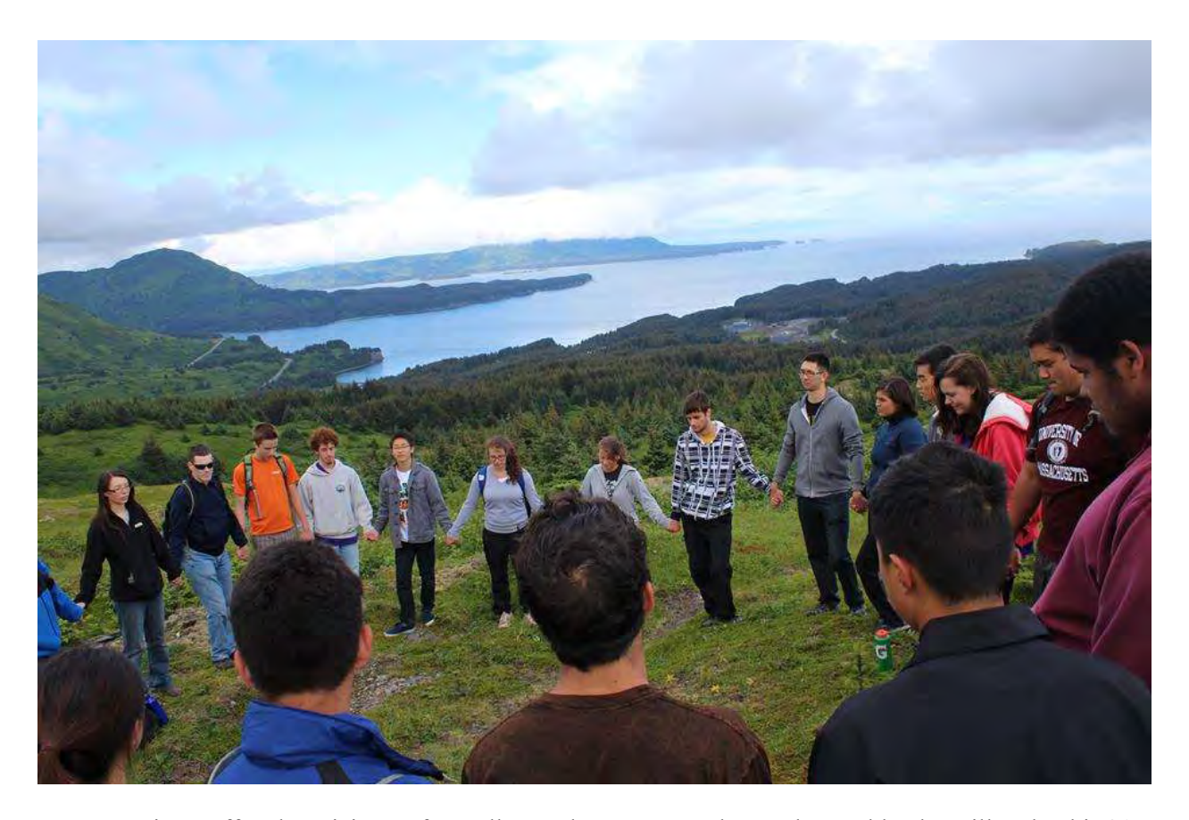
Meet amazing staff and participants from all over the country and even the world, who will make this 21-day program truly unforgettable and precious!

So get ready to gear up, hop on a Good Go boat, and prepare for an experience like no other!