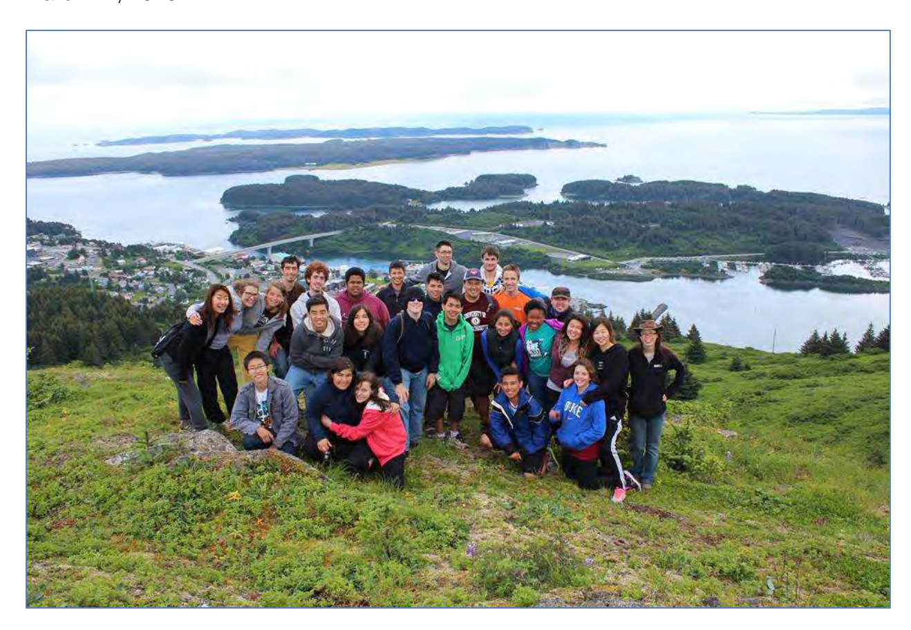
The 2016 National Ocean Challenge Program in Kodiak, Alaska, is looking for fishers of the sea and adventure! Registration has started earlier than ever, and applications are piling in. The program is directed toward young Unificationists between the ages of 16 and 25 and will take place this year from July 10-30. Space and scholarships are limited, so the time to apply is NOW!

Set foot onto Kodiak Island, the Emerald Isle, known worldwide as one of the richest fishing grounds and as a place where True Parents spent much of their time and heartfelt investment. Based on True Father's vision to use the ocean as a training ground for educating youth and leaders, this program offers many opportunities to grow and learn. You just have to fish for them!