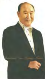
Front cover of Father Moon's autobiography.

Part 1 of a series commemorating Marie Živná. See part 2