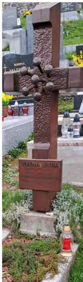
From the grave of the Živna family.