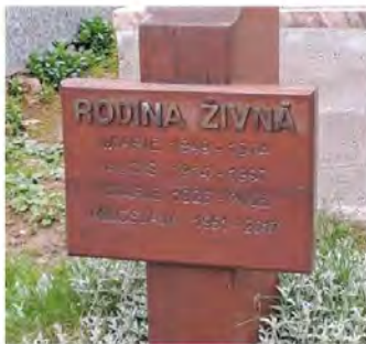
From the grave of the Živná family in Svojanov, Czech Republic.