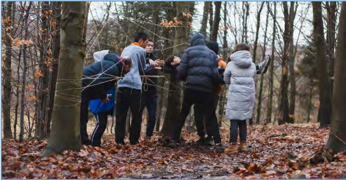
We had also a challenge day, where the teams have been tested in trusting each other, communicating, team work, vulnerability and knowledge.