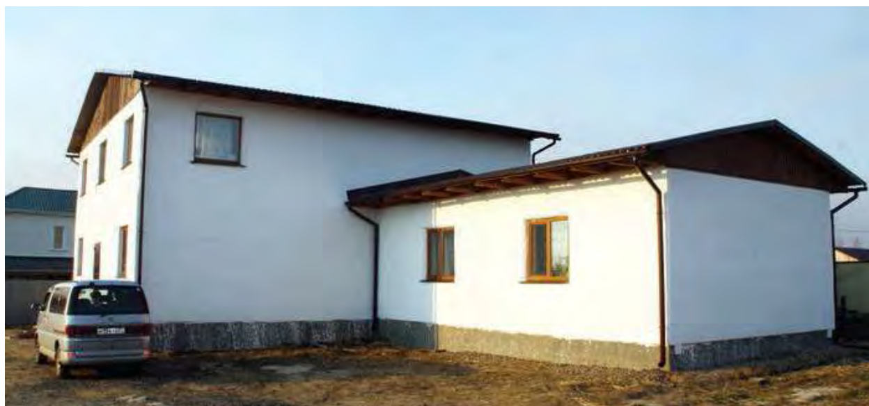
The newly built church in Khabarovsk, Russia

He did not even believe in God and never talked about such things, so that was surprising. He said, "I am already over forty. Years are passing."