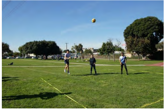
Day 3 Photos: