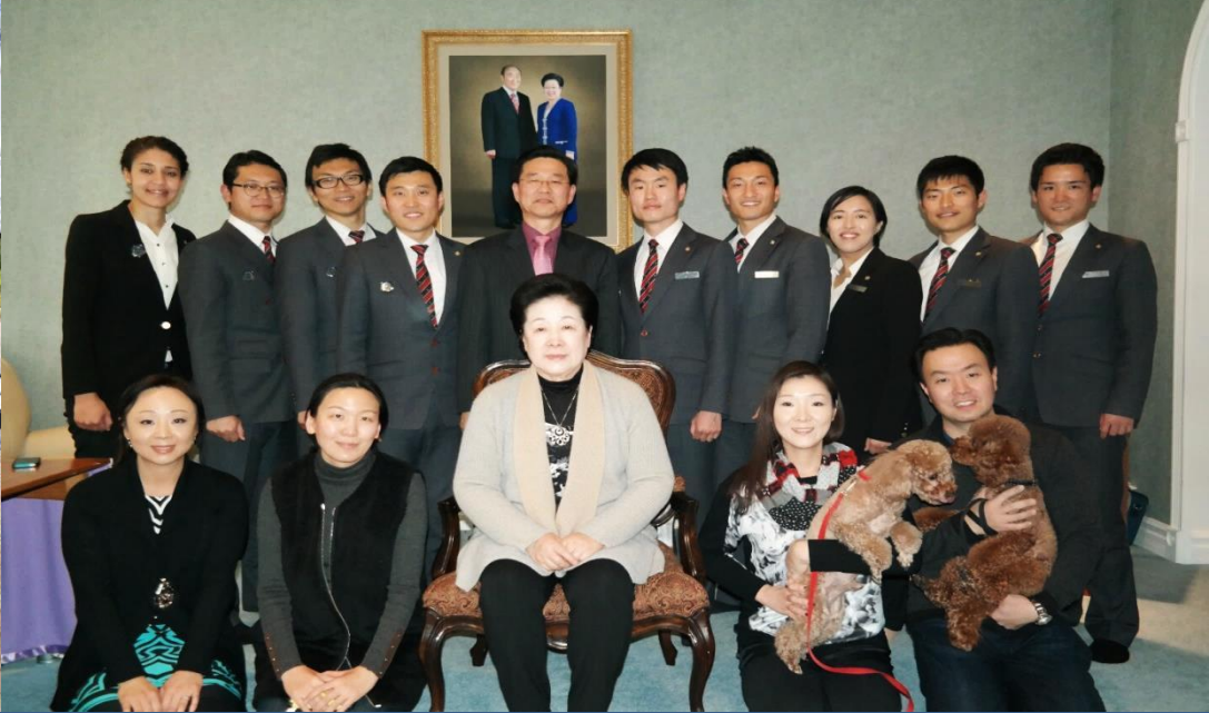
Meeting with True Mother