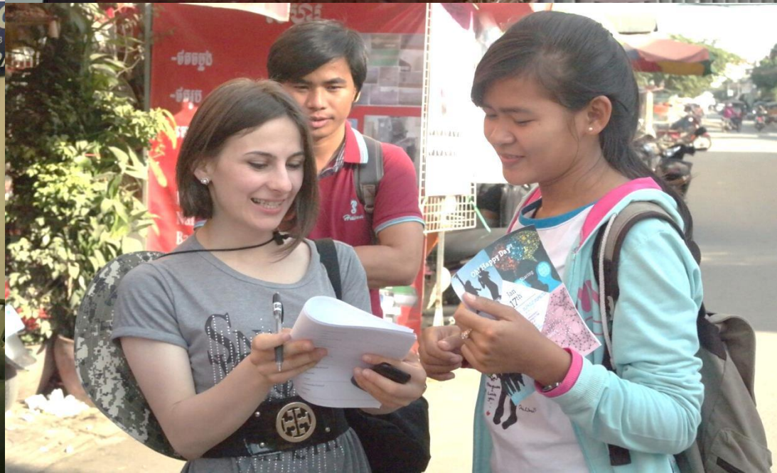
Overseas Activities (Youth Witnessing)