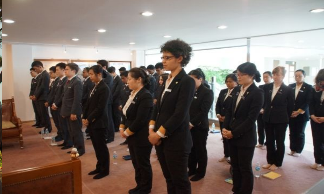
Holy Ground Pilgrimage