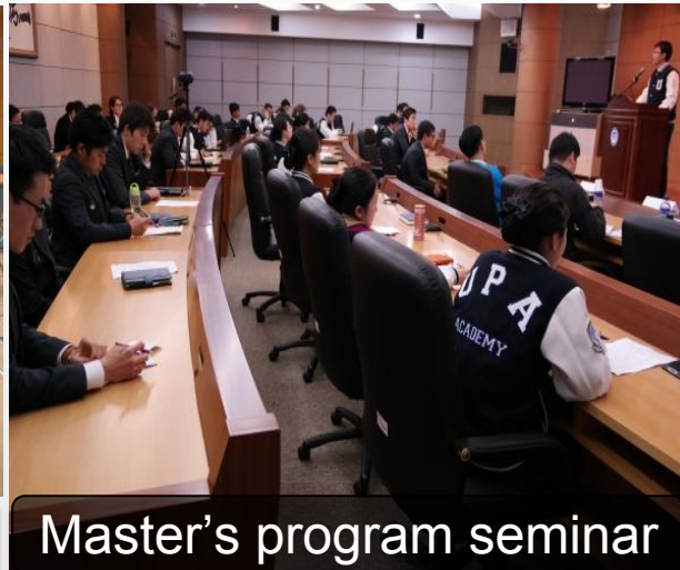
Master's program seminar