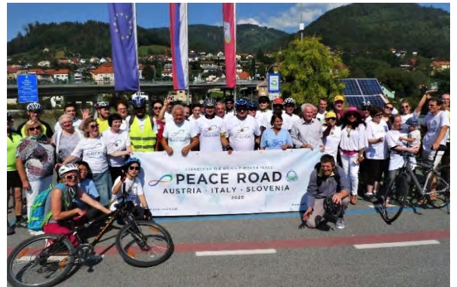
At the Dravograd Bridge, the first stop in Slovenia

The Slovenj Gradec municipality was very cooperative, offering all the technical support and media promotion of the event as well as the municipalities Dravograd and Crna na Koroskem from where two women mayors were already awarded as AFP in 2013.