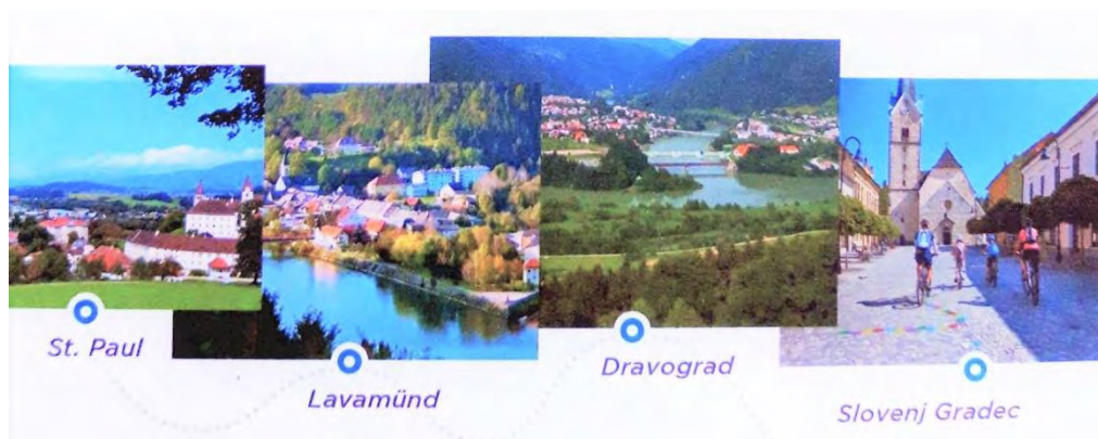
The four venues connected through this year's Peace Road

Here is some historical background why this route was chosen in particular: