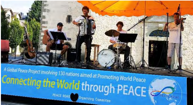
Performance of Scottish highland music