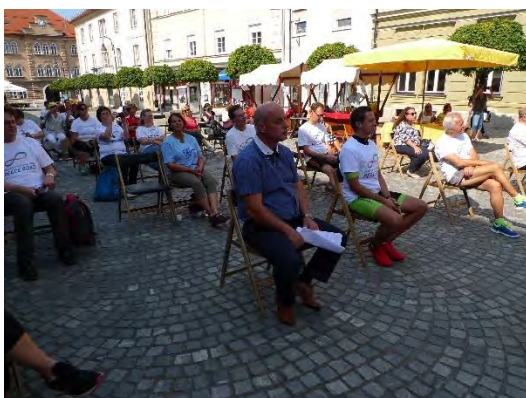
At the main Square in Slovenj Gradec

Here are pictures below depicting the afternoon event at the main square of Slovenj Gradec, the award ceremony for the Ambassadors for Peace and various international performances.