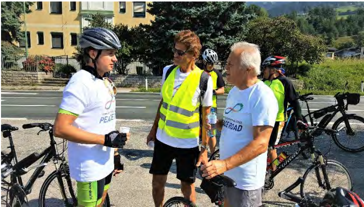
Our two mayors at the rest stop.