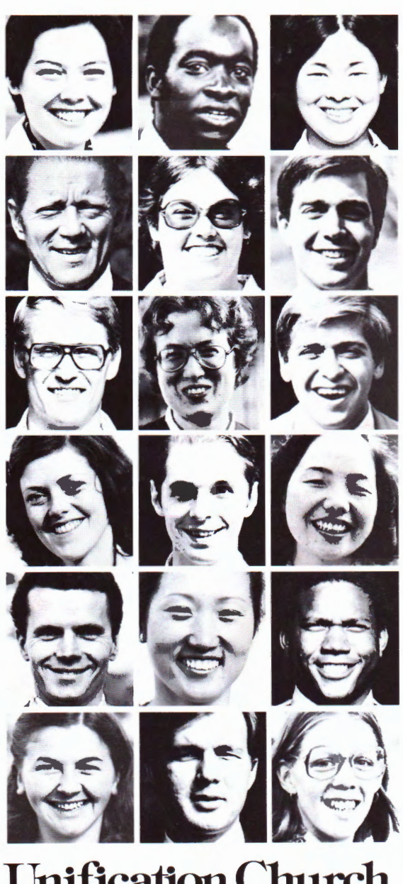
Unification Church Only if you discover things for yourself.