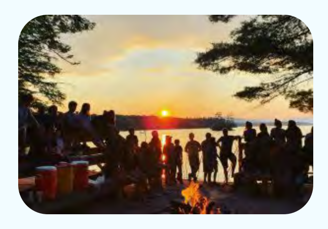
Build Meaningful Relationships

Spend quality time with other campers and staff members throughout the fun-filled event.