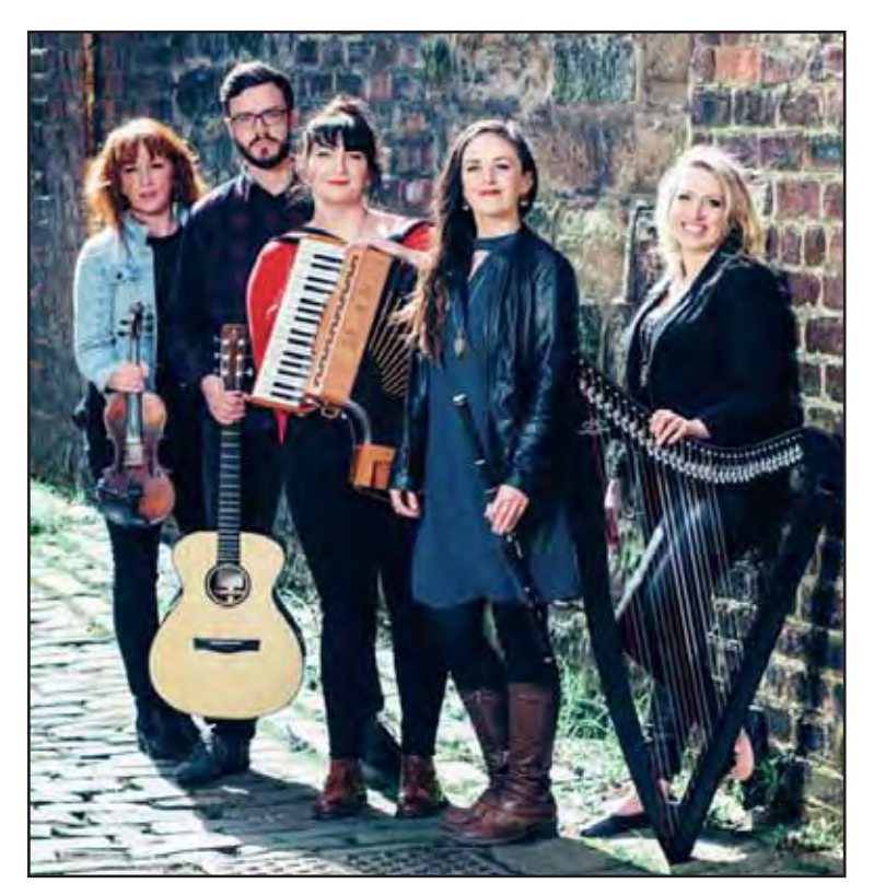
Internationally acclaimed, The Outside Track return to northern New Hampshire at the Rialto Theatre in Lancaster on Tuesday, Sept. 4. Tickets for this GNWCA show are now on sale.

The Outside Track is one of the top Celtic acts in the world. Winner of "Best Group" in both the Live Ireland awards and the Tradition In Review awards. Live Ireland called them, "Among the top bands in the world–stunning on every cut."