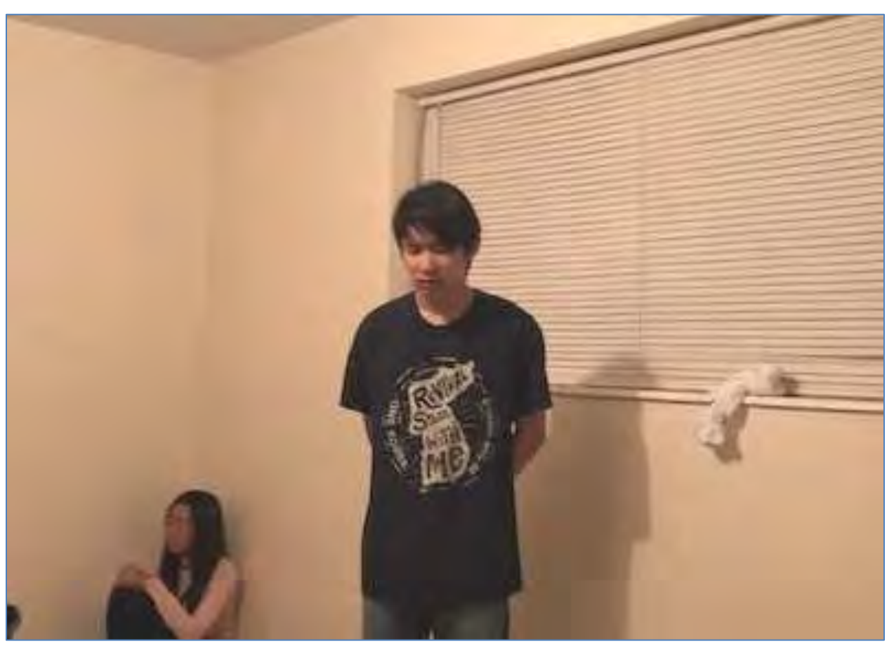
T. guides the final activity.

At the end of the retreat, participants focused on one of the core values of CARP, service and living for the sake of others. They made cards of gratitude for men and women in uniform that will be sent to active duty military members.