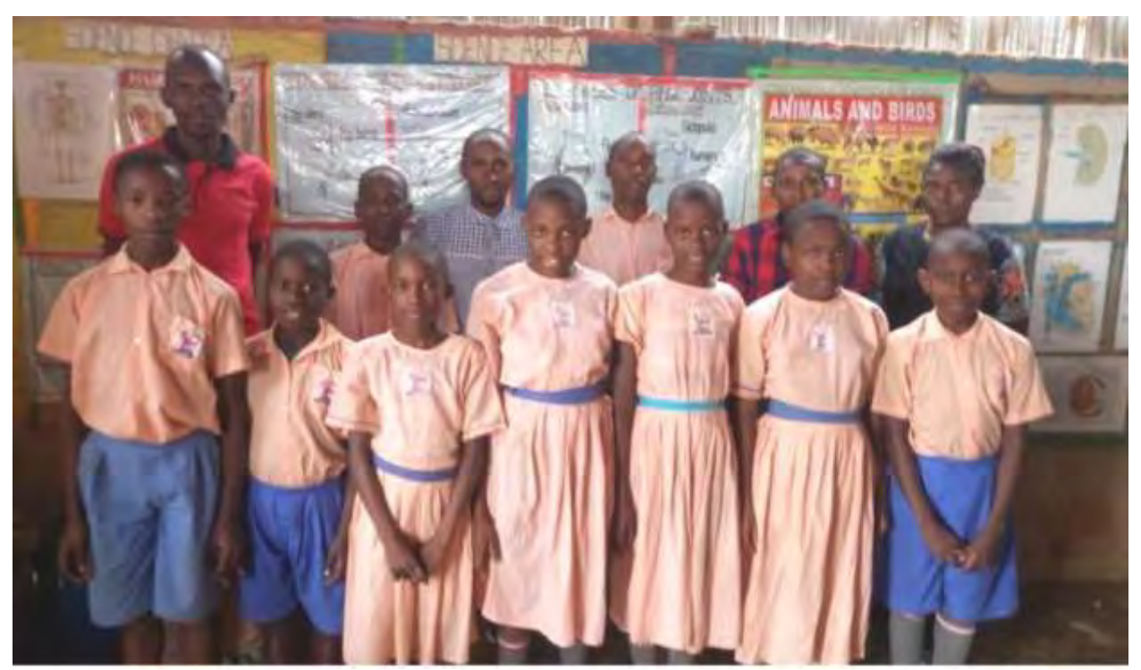
Primary Seven and their Teacher, 2019

The school opened for the second term on 20th May 2019. The children and teachers are healthy, happy and promising to academically perform well. The parents and the school community are grateful for the library that has improved on the pupil's reading culture. The new land procured for it has buildings which is now accommodating some teachers and staff members.