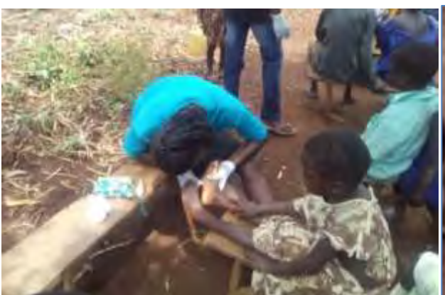
Mobile Medical Team working

The medical team managed to treat jiggers to 27 people, and controlled pest from homes. 19 houses were attended to at Mayuge district Bufulubi village. The community members were grateful for the service they received. 8 volunteers were on the team.