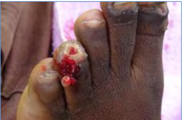
The effect of Jiggers on the foot