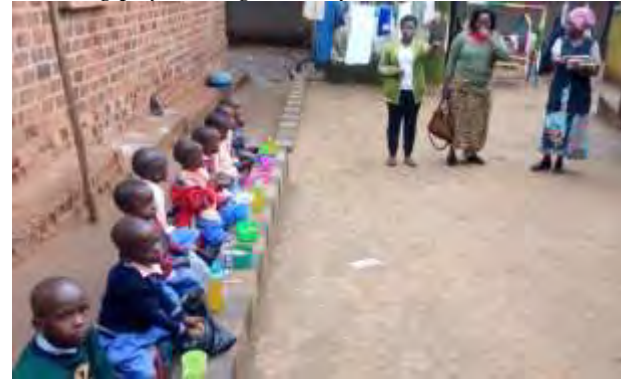
Baby Class having breakfast