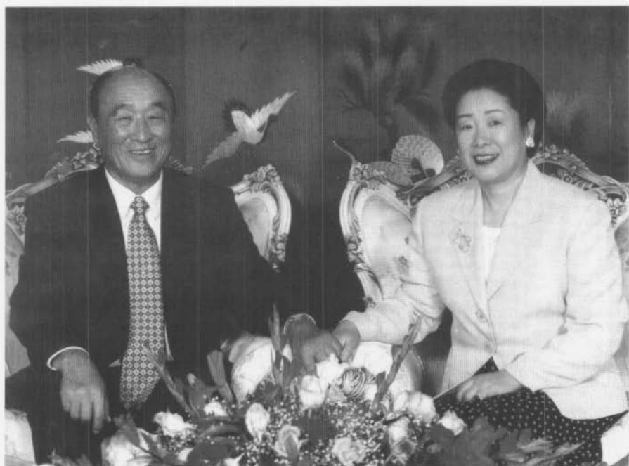
True Parents, Rev. Dr. Sun Myung Moon and Dr. Hak Ja Han Moon