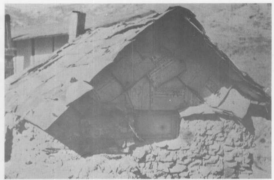
Rev. Moon built a six-square meter mud-walled but out of cardboard ration boxes on a lonely hill by a cemetery. It is the first secure base he had in a city swollen with hundreds of thousands of refugees.