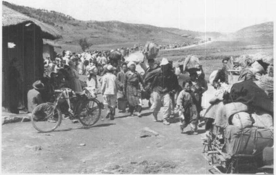
As the Korean War raged up and down the peninsula, virtually the entire nation found themselves refugees. Busan, the southernmost tip of the peninsula, was the destination of last resort, and the population tripled in a few weeks.