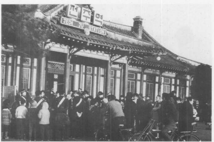
Early members of the church would give speeches and lectures in public places. Here, students gather to hear a talk outside Jeonju Station.