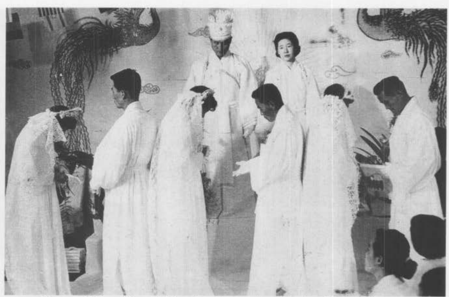
Rev. and Mrs. Moon officiated at the marriage blessing of their followers.