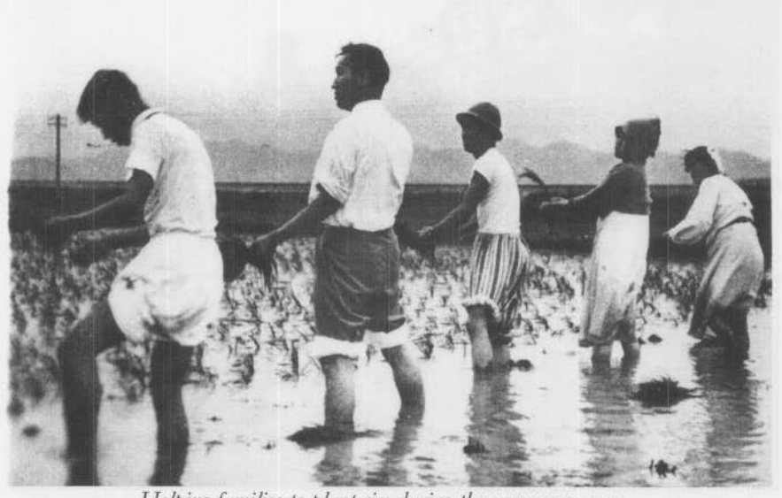
Helping families to plant rice during the summer season.