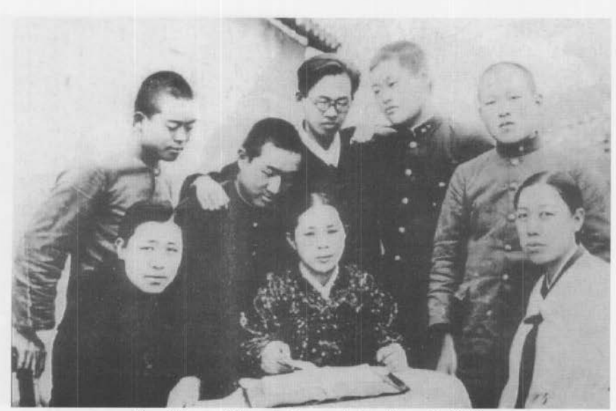
Rev. Moon with a missionary during the early 1940s