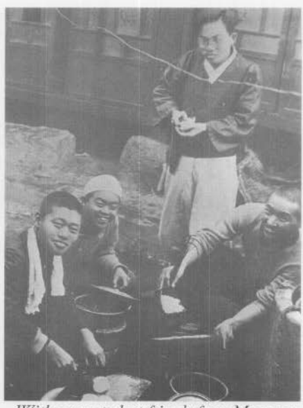
With some student friends from Myeongsudaechurch during the late 1930s