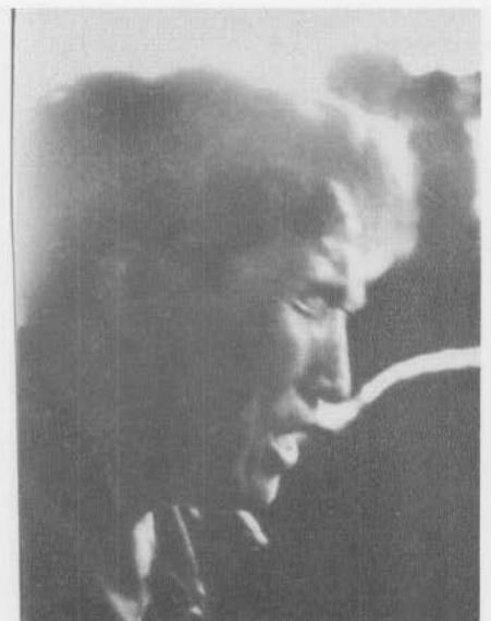
His fervent preaching and uncompromising stance drew lots of attention.