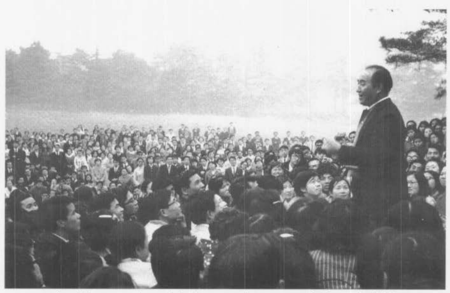
Speaking to members of the large, growing movement in Japan in 1969