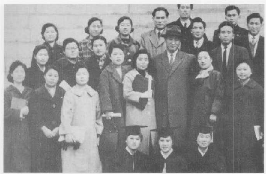
Students and faculty from prestigious universities in Seoul joined the movement, causing alarm to school authorities. Eventually Rev. Moon was arrested and imprisoned on various charges that were later all dropped.