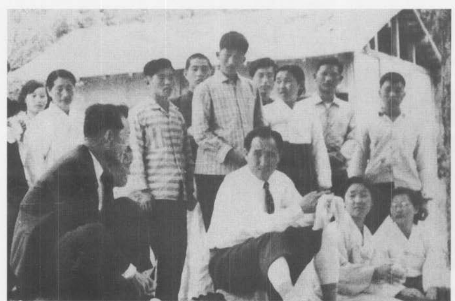
Every summer, the members dispersed from the cities and go into the country. They would lecture the Divine Principle, teach children and adults to read and write, and perform community service. Rev. Moon traveled around by jeep to meet them all.