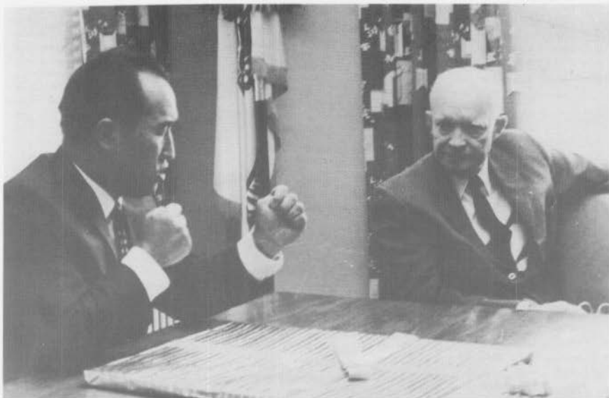
At an early meeting with former US President Eisenhower, Rev. Moon discusses the role of the United States in God's providence.