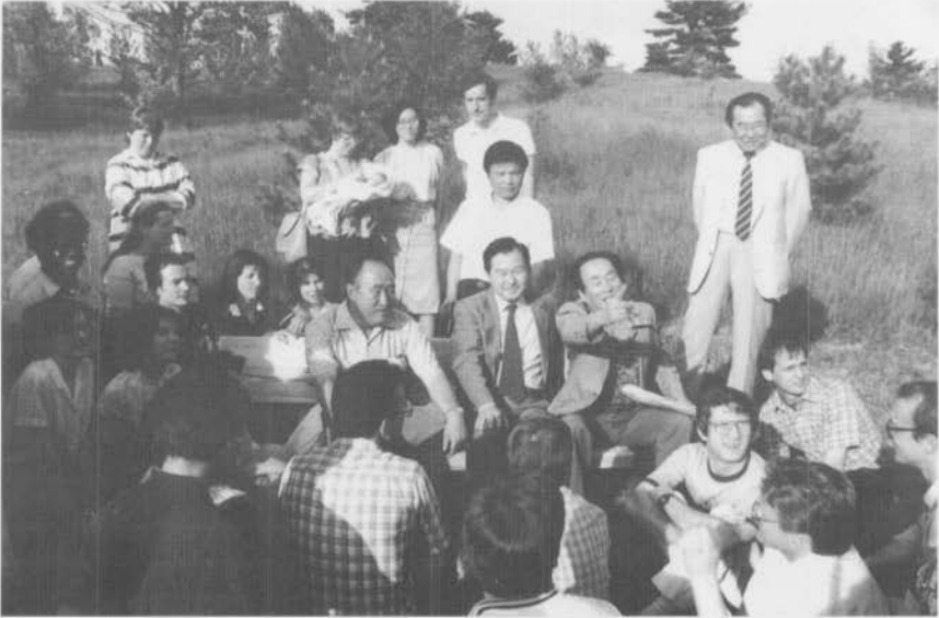
Rev. and Mrs. Moon invited young people from around the world to New York for a leadership training program in the early 1970s.