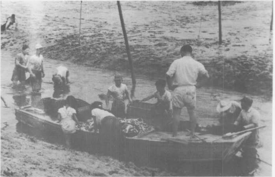
Fishing is one of the great loves of Rev. Moon's life. He has caught bluefin tuna in the Atlantic, halibut in Alaska and dorado in Brazil, among many others. But the early days were much less glamorous, as this picture of fishing in the Incheon tidal flats shows.