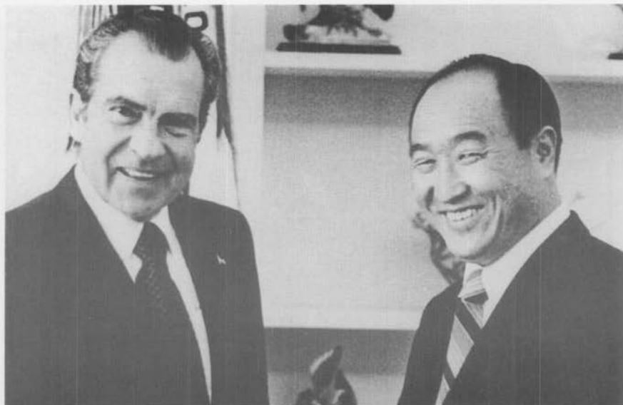
In 1974, Rev. Moon encouraged President Richard Nixon to repent to the American people for the sake of the nation and in particular to avoid defeat in Vietnam. From that time on, many political enemies emerged.