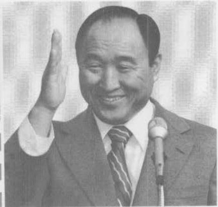
Reverend Sun Myung Moon Principal Speaker