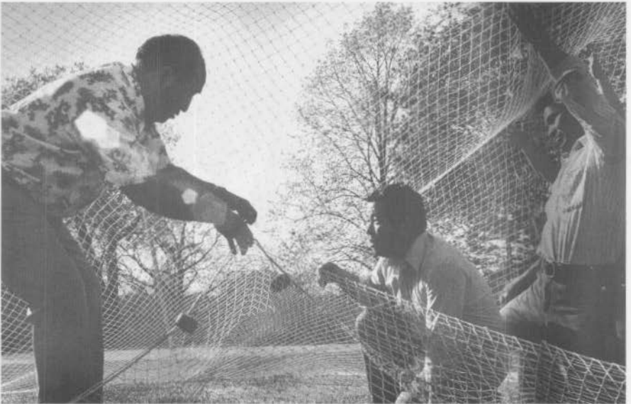
In the early days, Rev. Moon visited the seminary almost every day. A keen fisherman, he showed the students and faculty how to mend nets to fish the Hudson River lagoons