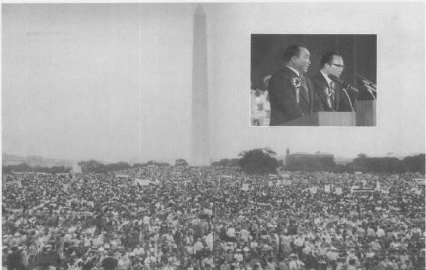
At the Washington Monument in September 1976, Rev. Moon spoke on "God's Hope for America" in front of 300,000 people.

In 1976, the year of the United States Bicentennial, Rev. Moon launched the "God Bless America Festival" with two large scale rallies. This postcard was sent to all New Yorkers inviting them to the first event at Yankee Stadium