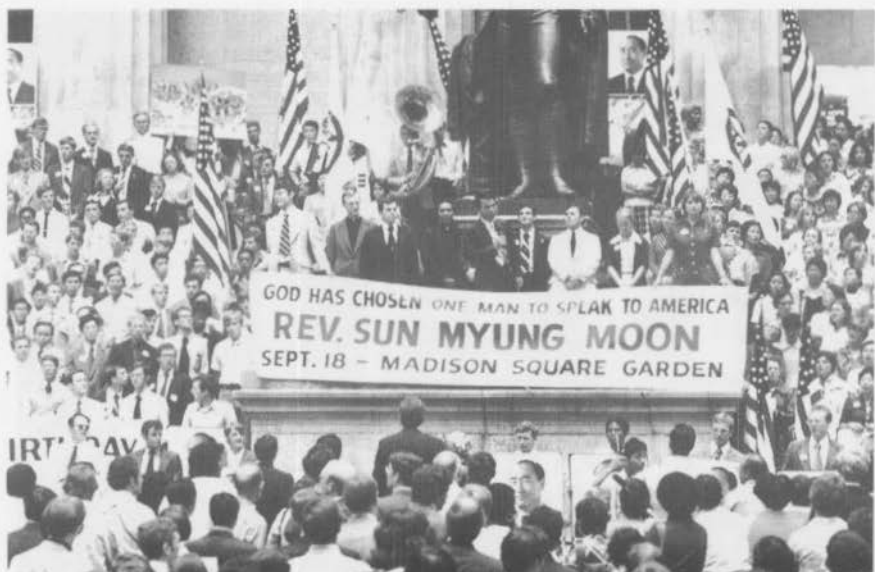
A Day of Hope Rally in New York City to promote the Madison Square Garden speech in September, 1974