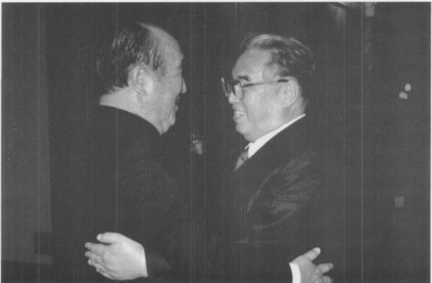
In 1991, Rev. & Mrs. Moon were at last able to return to their homeland of North Korea. Meeting with then Premier Kim Il Sung helped begin a process of reunification.