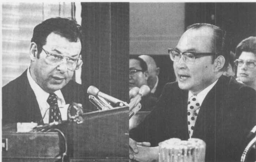
In what became known as Koreagate, in 1977 US Congressman Donald Fraser falsely accused members of the movement of working for the Korean CIA.