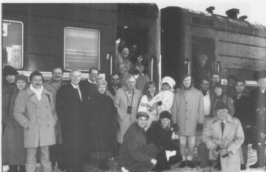
A group of Western journalists on a World Media Association fact-finding tour in the early 1980s prepare to travel from Moscow to Leningrad (now St. Petersburg).