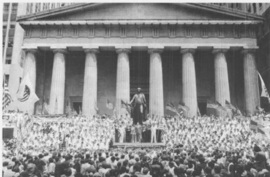
A Day of Hope Rally in front of Federal Hall in New York City.