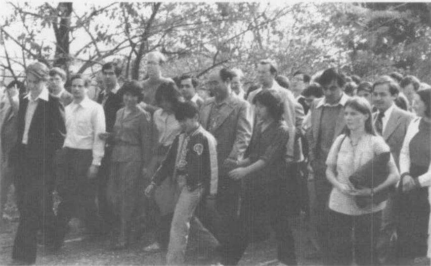
Rev. Moon taking a walk through the grounds of the Unification Theological Seminary with some members of his family and students.