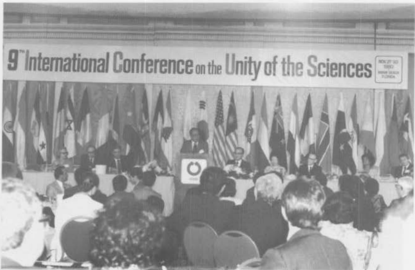
The annual ICUS conferences drew scholars from around the world to discuss issues of absolute values and underlying harmony among many fields of knowledge.