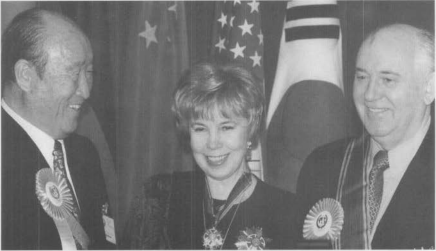
Noted as a leading anti-communist for decades, Rev. Moon maintained a strong love for the people under communist regimes. He met Mikhail Gorbachev in Moscow in April 1990 and encouraged him to let Soviet youth learn about God.