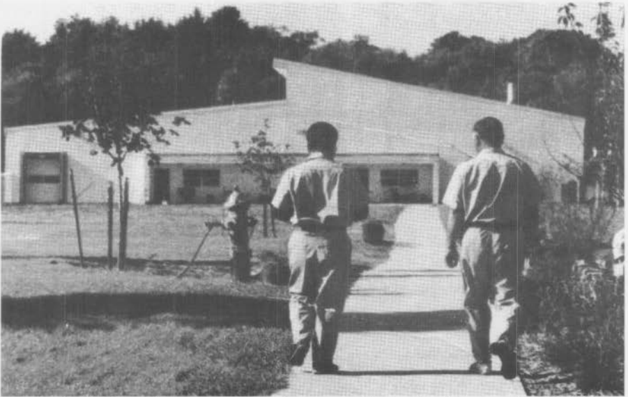
In 1984, Rev. Moon was sent to prison at age 64 for allegedly not paying $7,000 in taxes, despite investing millions of dollars in the spiritual and moral renewal of the US. He is seen here in the grounds of Danbury Prison in Connecticut.