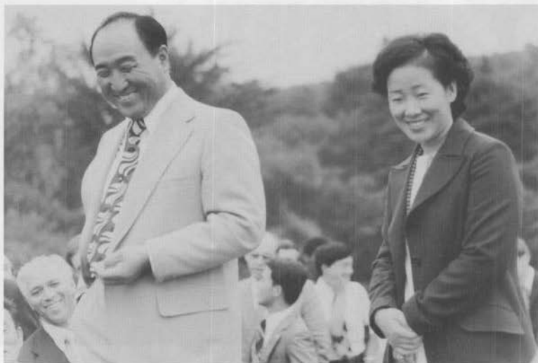
In the United States, Rev. and Mrs. Moon shared with the young members and their love was a practical model of how to build a God-centered society.