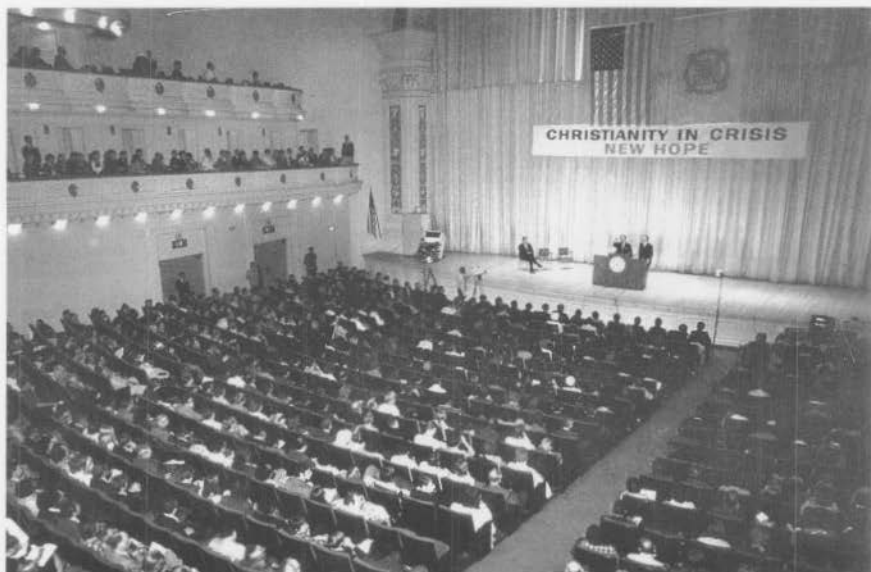
Though at the time he spoke almost no English, with the help of an interpreter he embarked on a seven-city speaking tour of the US, here in Carnegie Hal in 1973.