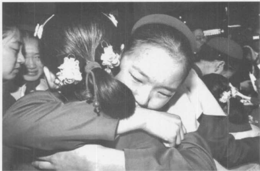
Soon after Rev. Moon's historic meeting with Kim Il Sung in 1991, members of the Little Angels Korean Folk Ballet brought the message of peace and hope to Moscow and Pyongyang.