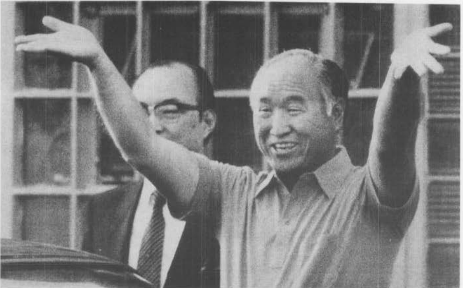
Upon his release from prison in 1985, Rev. Moon was welcomed by Christian leaders from all over the US. More than 40 churches had supported his legal battles.