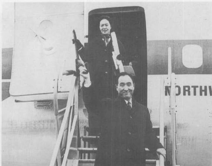
Departing for on the World Tour 1965. Rev. Moon visited 40 countries altogether during this trip. In each country he consecrated a 'Holy Ground' as a place of prayer