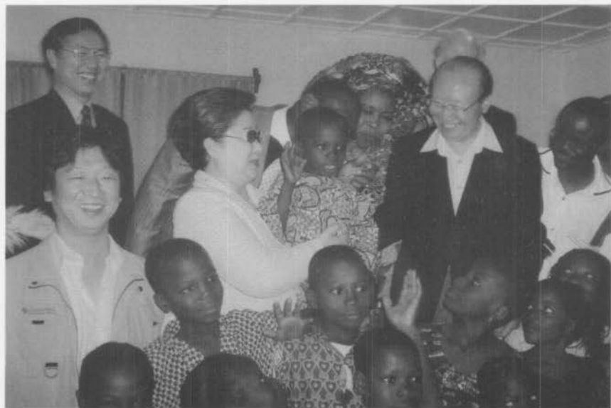
Mrs. Moon visiting an African school sponsored by the International Relief Friendship Foundation during the World Peace Tour, 2005