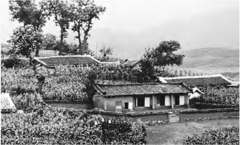
The home in North Korea where I was born. It originally had a small wing on each end, but now, only the main building remains.