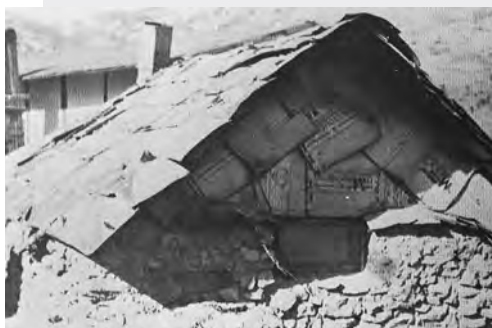
Above: The mud-walled hut that Won Pil Kim and I built in early 1951 out of ration cartons stood on a lonely hill by a cemetery in Busan.