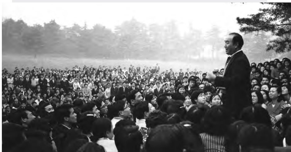
In 1969, during my second world tour. The movement in Japan had grown enormously, and our meetings had to be held in large outdoor venues like this park in suburban Tokyo.