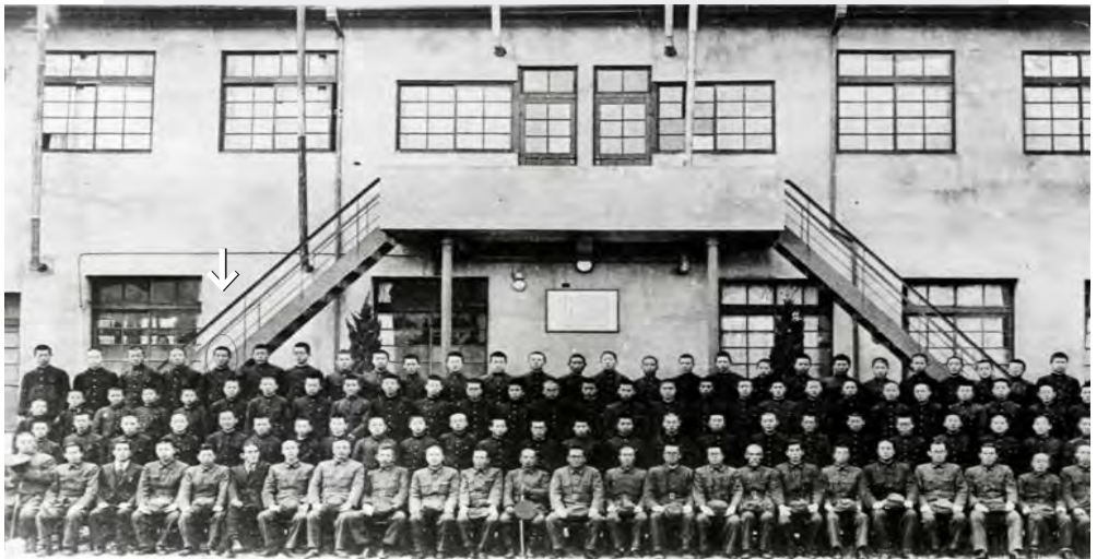
March 8, 1941. Commencement ceremony of the third graduating class of Kyeongsung School of Commerce and Technology. I am in the back row, fifth from the left (see arrow).