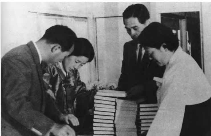
On May 1, 1966, the 12th anniversary of the founding of the Unification Church, I signed copies of the Korean-language second edition of my teachings, the Divine Principle . I am on the left.