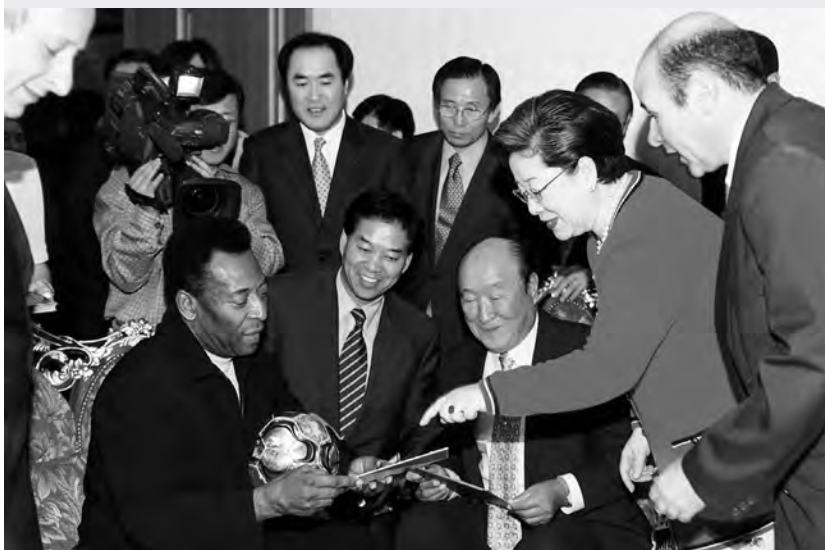
On June 4, 2002, soccer great Pelé paid a courtesy visit to my residence in Hannam-Dong. Here my wife explains the World Peace Cup Soccer Tournament. I shared with Pelé the vision of promoting soccer as a way to build bridges of peace between nations.