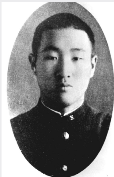
Left: My student photo in 1941, the year I graduated from technical school, where I studied electrical engineering.