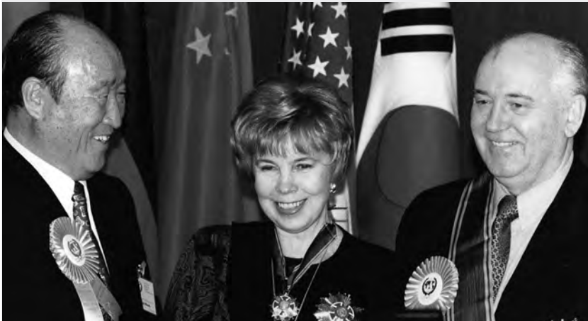
On March 24, 1994, I hosted President Mikhail and First Lady Raisa Gorbachev at the Summit Council for World Peace in Korea. I founded the Summit Council to convene former heads of state to deliberate on solutions to conflicts.