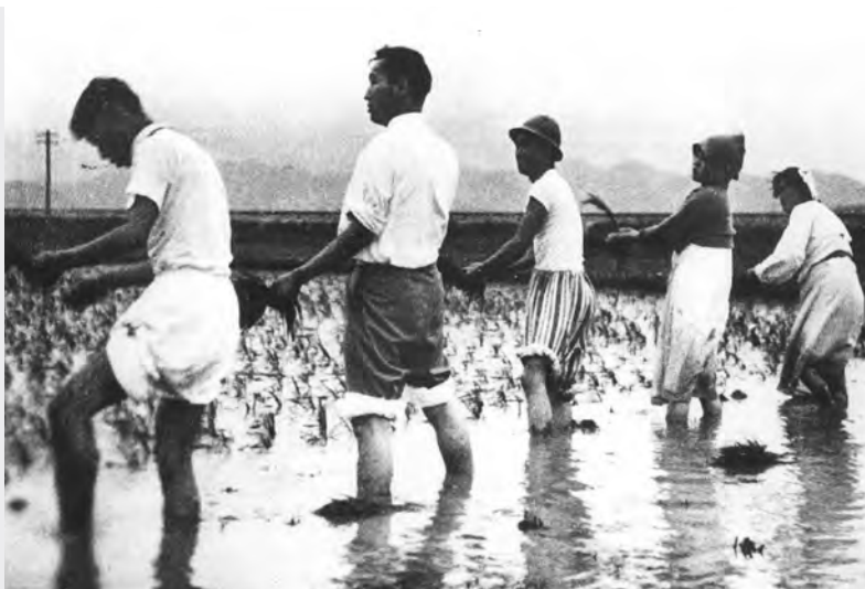
Early spring 1959 in Yamok, Kyeonggi Province. I took the members to help plant rice. The farmers benefitted, and for us it was training.