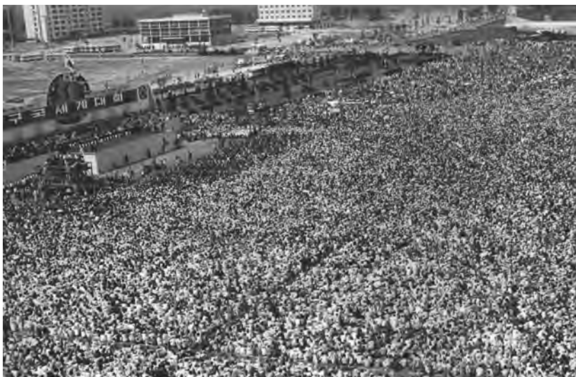
More than 1.2 million people attended the World Freedom Rally in Seoul's Yoido Plaza on June 7, 1975.