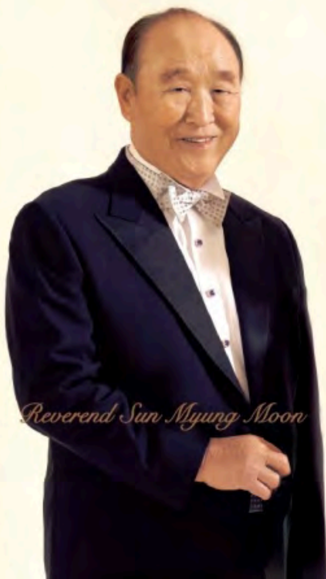
Reverend Sun Myung Moon