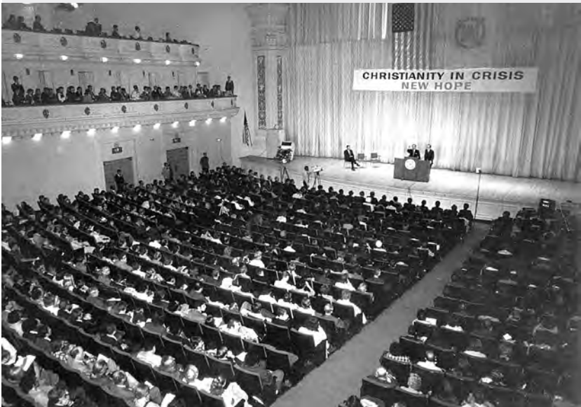
New York's Carnegie Hall on October 1, 1973, the first stop on a 21-city speaking tour of the United States that ended January 29, 1974.