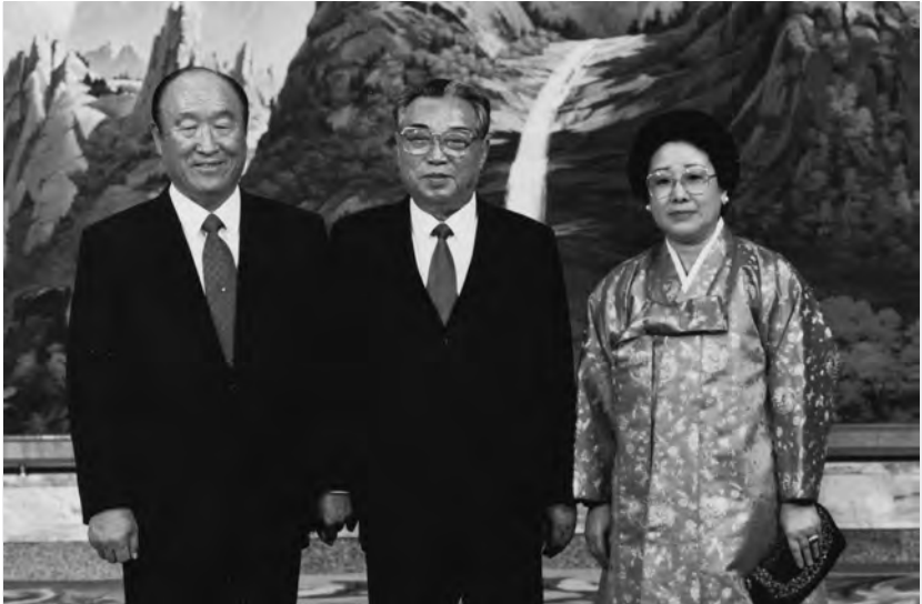
On December 6, 1991, my wife and I traveled to Pyongyang, North Korea, at the invitation of President Kim Il Sung, and met with him in the Majeon Presidential Palace in Heungnam.