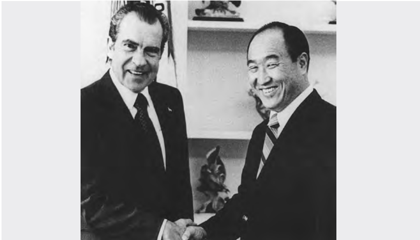
February 1, 1974, meeting President Richard Nixon at the White House at the height of the Watergate controversy. For the sake of a strong, unified America, I asked Americans and the media, through newspaper ads, to “Forgive, Love and Unite.”