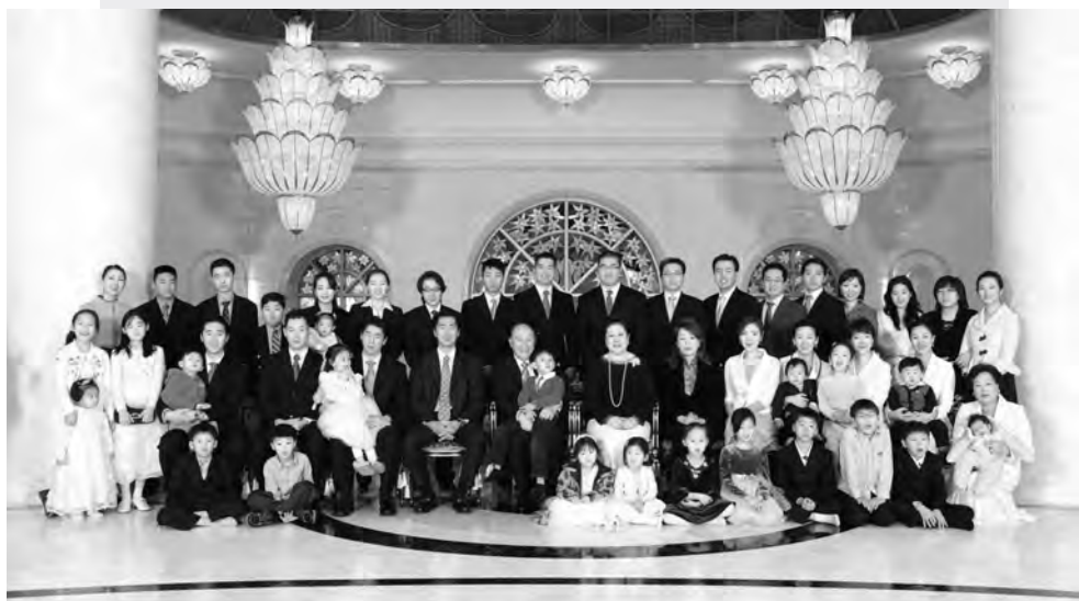
Even this family portrait taken in Korea on January 1, 2009, doesn't include everyone. We have 14 children, living in different parts of the world, and an ever-growing number of grandchildren and great-grandchildren.