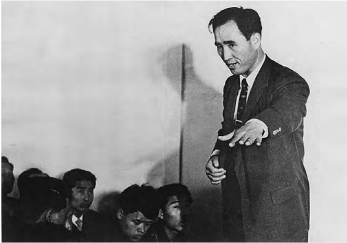
Teaching members in our church in Cheongpa-Dong right after coming out of Seodaemun Prison.