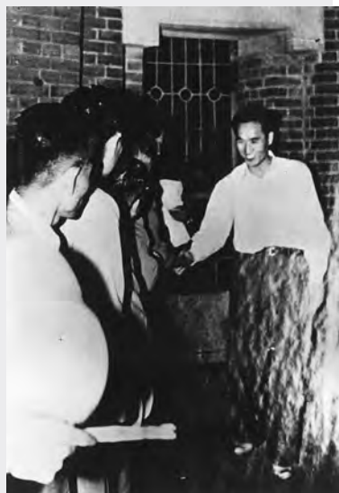
Right: I was greeted by our members after my release from Seodaemun Prison in Seoul on October 4, 1955. I was indicted for “draft evasion” even though I had been in a North Korean prison camp during the war. I was declared innocent after serving three months in jail.