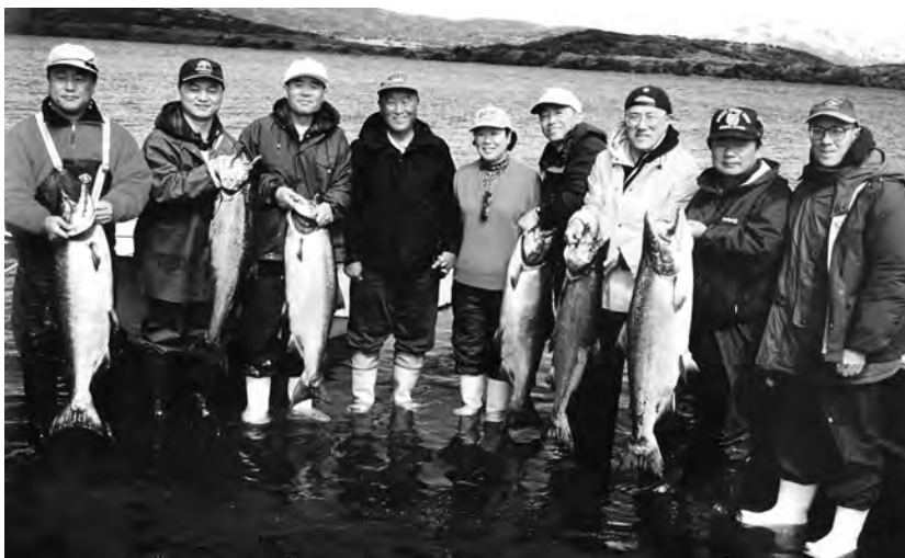
August 1998, fishing for king salmon in Kodiak, Alaska. I am fourth from the left, next to my wife. Church leaders are on either side.