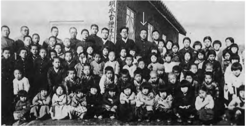
I taught Sunday School at the Myungsudae Jesus Church in Seoul in the early 1940s. I am standing in the back row (see arrow).