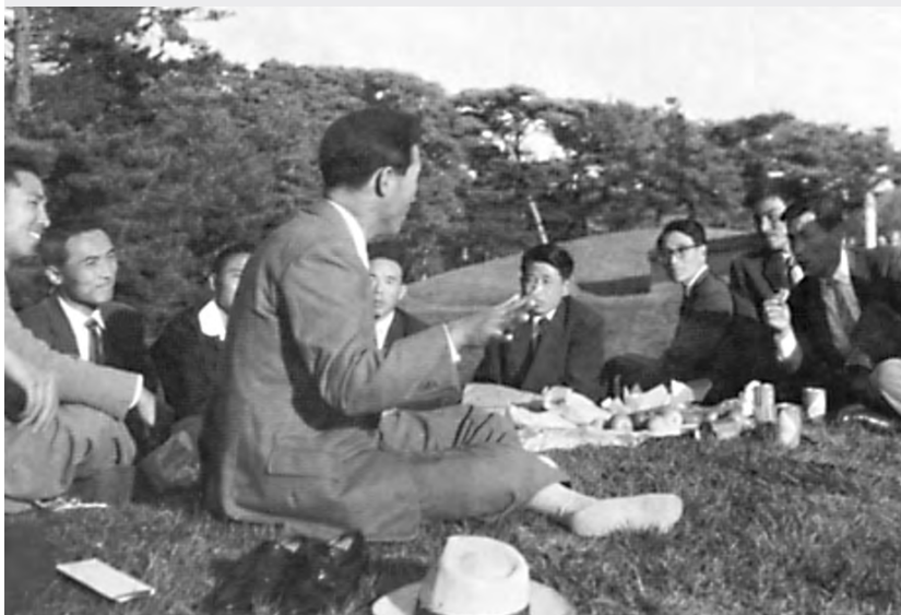
We often went outdoors in the Seoul area, where I would teach the members about God's Providence.