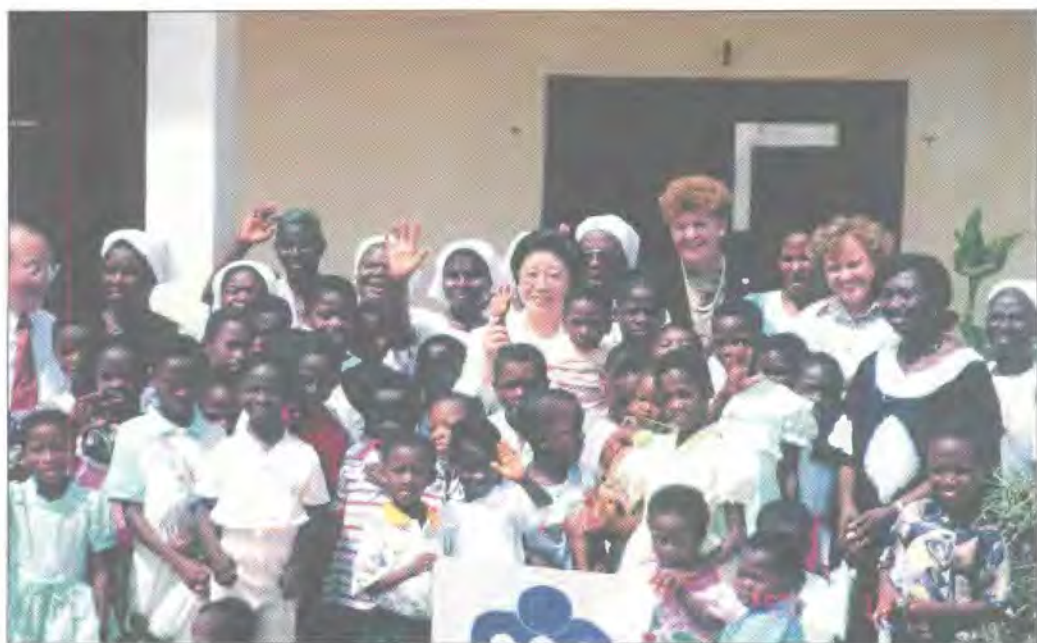
Dr. Hak Ja Han Moon visits a school in Ghana sponsored by the International Relief Friendship Foundation (IRFF), an NGO of which she is chairwoman. IRFF has provided food, medicine and education worldwide for 30 years.