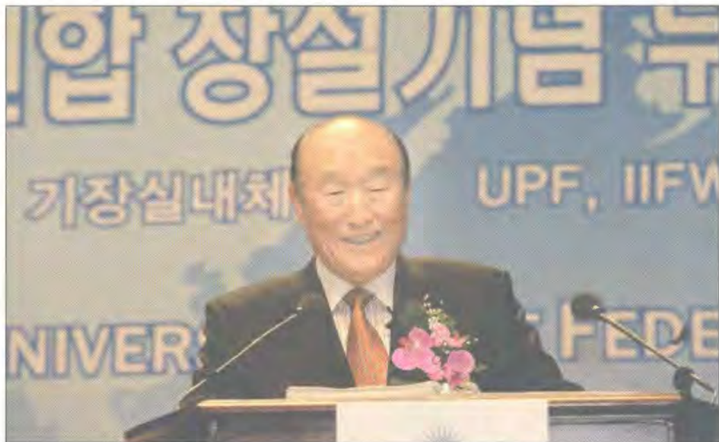
Rev. Moon speaking in Busan during the 100-city Peace Tour on the subject of "God's Ideal Family and the Kingdom of the Peaceful Ideal World," calling for intercultural marriage and interreligious dialogue as the best way forward to reach a world of peace.