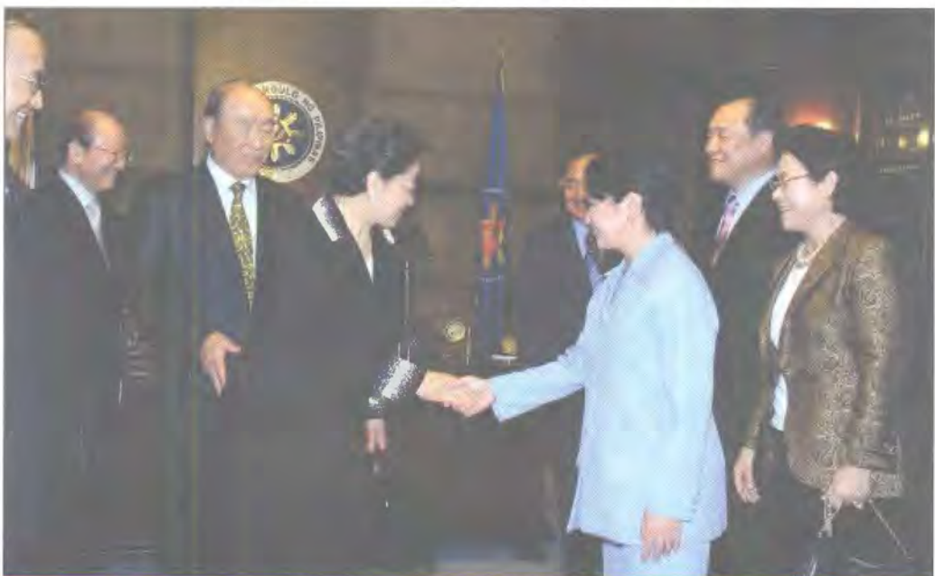
The President of the Philippines, H.E. Gloria Macapagal Arroyo, welcomes the Peace Tour to the Malacanang Presidential Palace in December 2005.