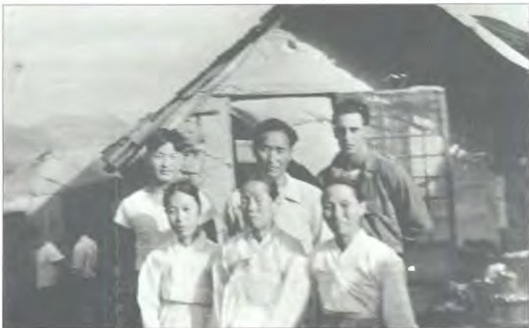
Sun Myung Moon and some of his early followers outside the cardboard shack that was his first church, in Busan, Korea. He had returned to the South as a refugee in 1950 after being imprisoned for nearly three years in a communist prison camp.