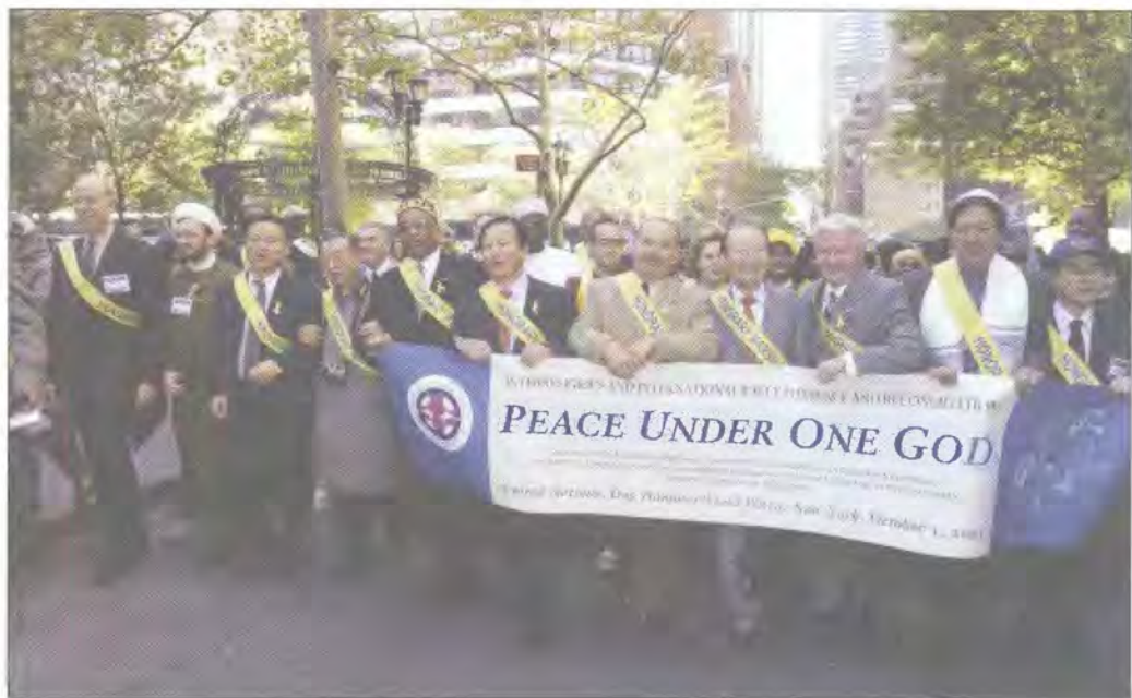
Religious leaders from many faiths join a march and rally for "Peace Under One God" held in Dag Hammarskjöld Plaza at the United Nations, October 2003.