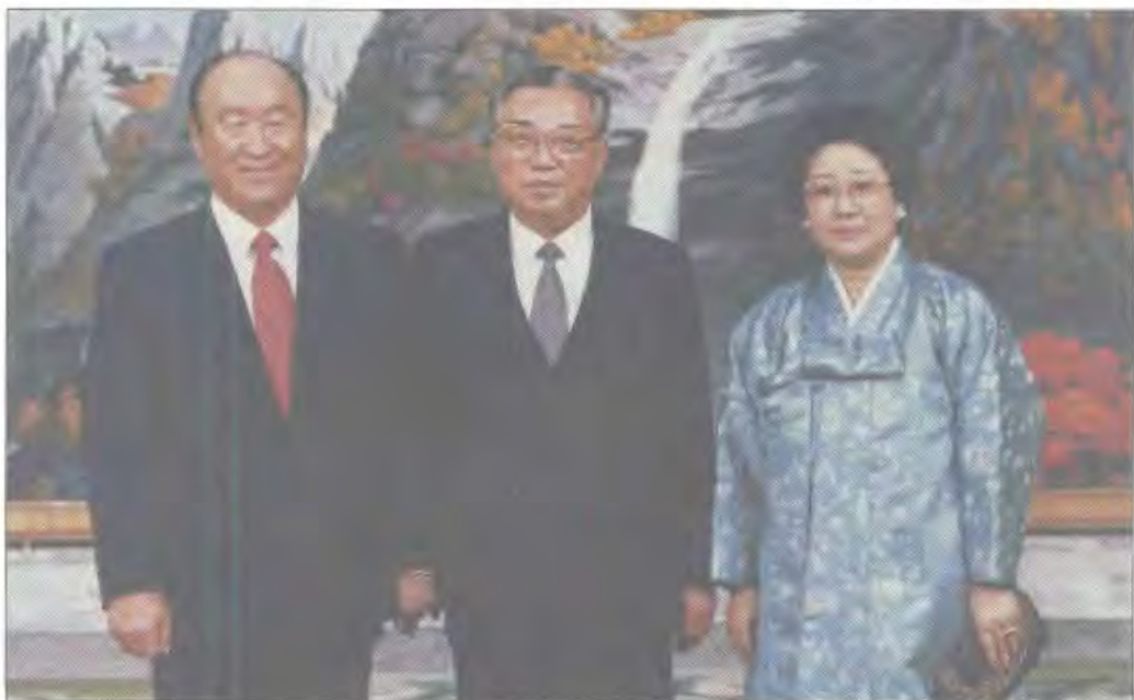
In 1991, Rev. & Mrs. Moon were at last able to return to their homeland of North Korea. Meeting with then Premier Kim Il Sung helped begin a process of reunification.