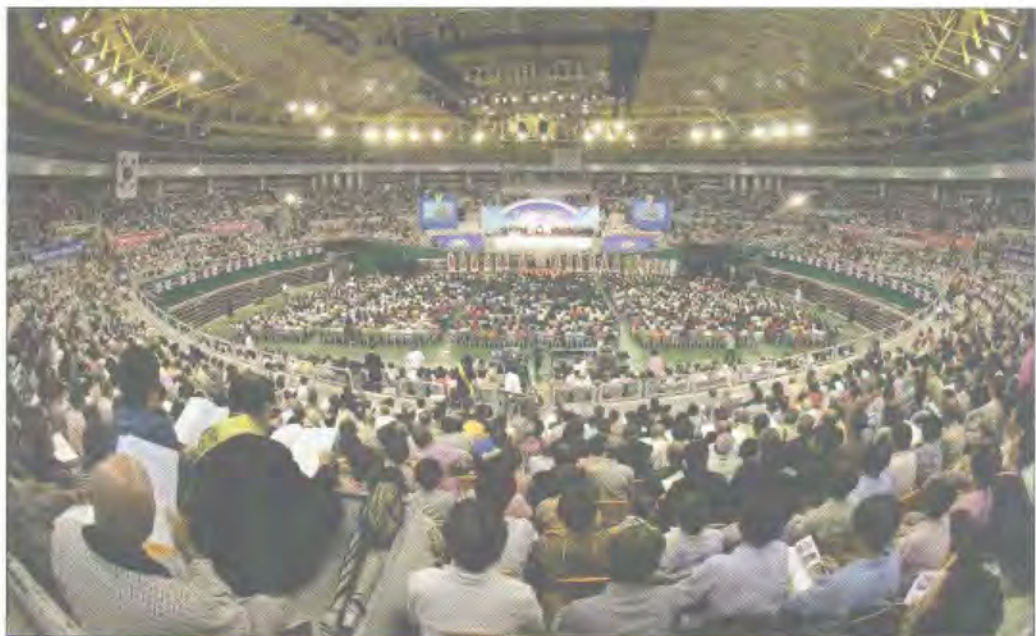
The success of the first UPF Peace Tour, which visited 100 cities in 100 days, led to four more tours in 2006, reaching millions in every nation of the world.