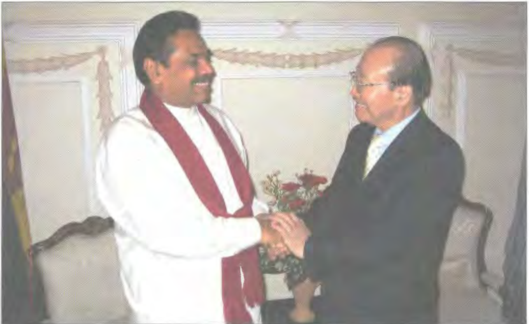
UPF Chairman Dr. Chung Hwan Kwak congratulates Ambassador for Peace and Sri Lanka President Mahinda Rajapakse following his election on a peace platform.