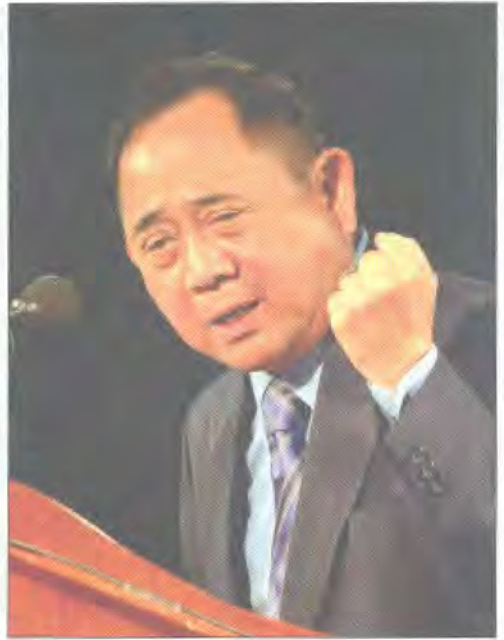
Abdul Karim Khalili, Vice President of Afghanistan, and José de Venecia, Jr., Speaker of the Philippine House of Representatives, are among the 50,000 Ambassadors for Peace. The initiative was launched by Dr. Moon in January 2001.