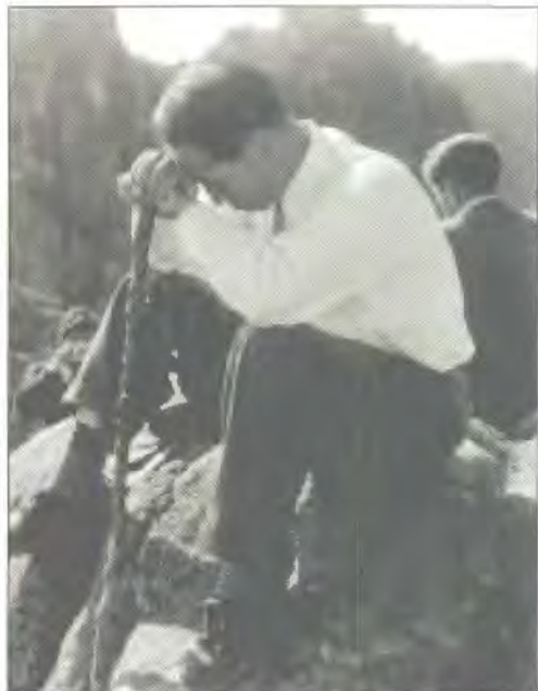
Sun Myung Moon was often jailed for his beliefs. He is shown here on his release from a Seoul prison in 1955. The surrounding mountains provided a welcome respite for prayer.