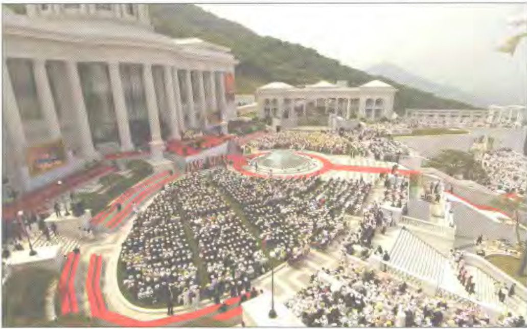
On June 13, 2006, more than 12,000 delegates gathered in the mountains of Korea for the opening and dedication ceremony of the Cheon Jeong Goong Peace Palace and Museum, now the site of regular peace gatherings and celebrations.