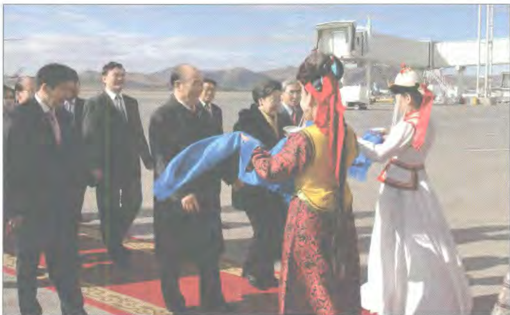
The Moons are welcomed to Ulaanbaatar, Mongolia, with a traditional drink of mare's milk. The Mongolian Peoples' Federation for World Peace aims to unify all people of Mongolian descent or origin, estimated as 74% of the world's population.