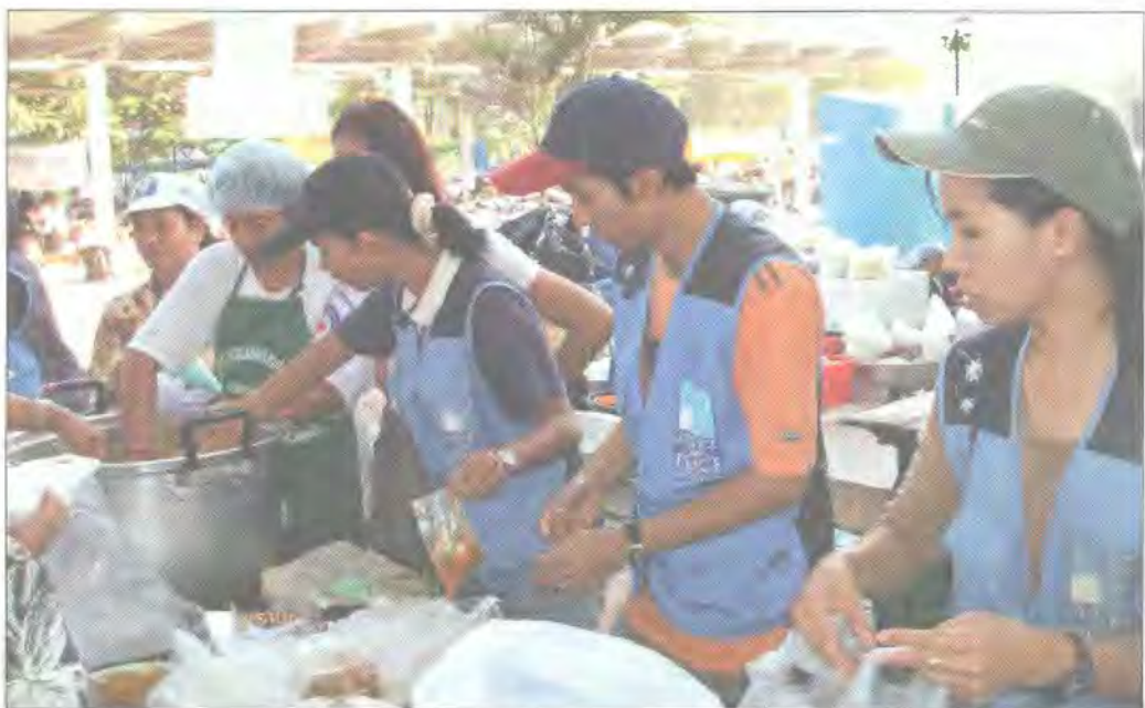
Volunteers from Service For Peace join other relief agencies in Thailand in the aftermath of the 2004 tsunami that left hundreds of thousands dead and millions homeless.