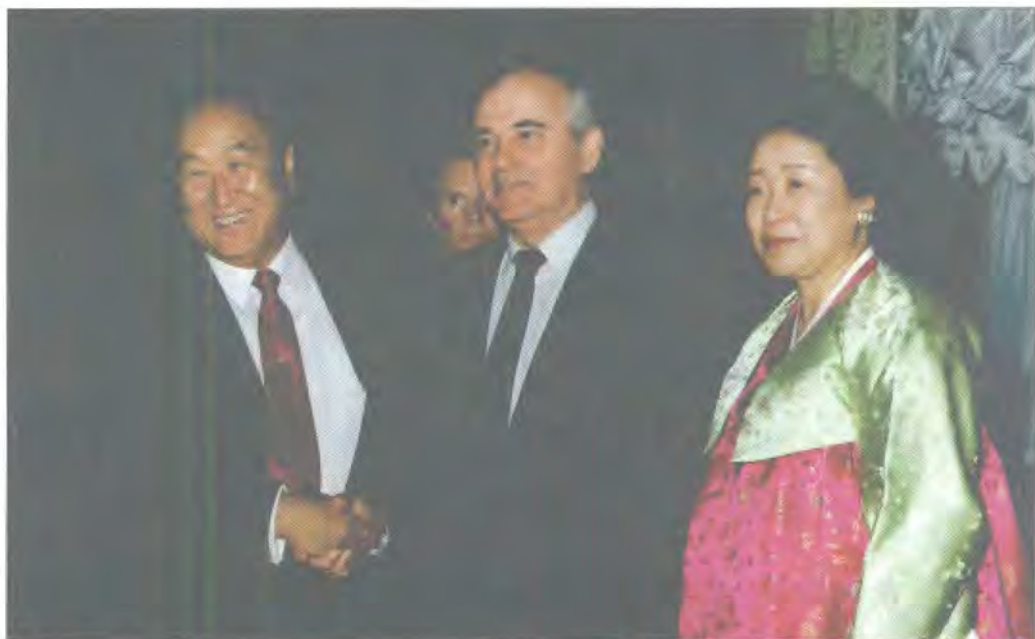
Noted as a leading anti-communist for decades, Rev. Moon maintained a strong love for the people under communist regimes. He visited Mikhail Gorbachev in Moscow in April 1990 to encourage him to let Soviet youth learn about God.