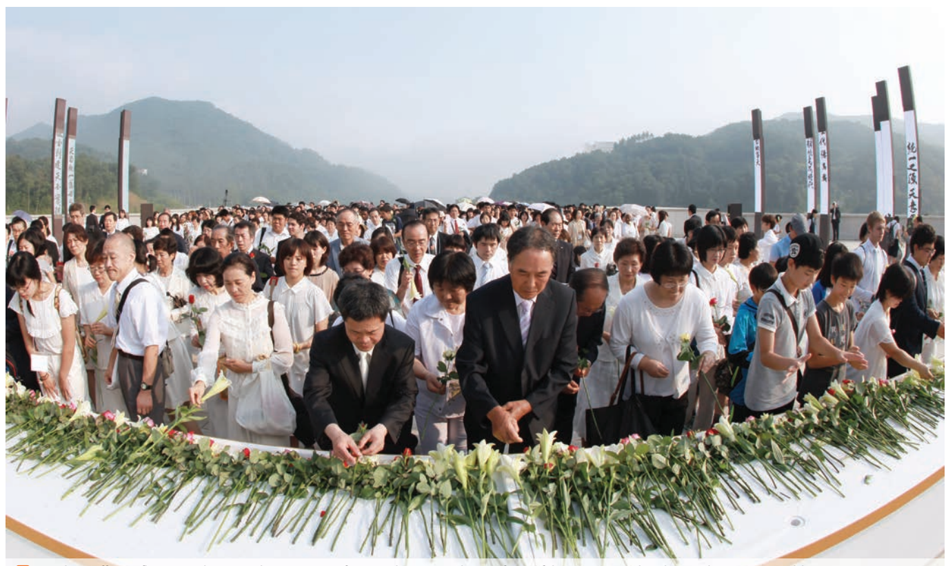
1 Members offering flowers at the second anniversary of True Father's seonghwa in front of the enrance to the Cheongshim Peace World Center