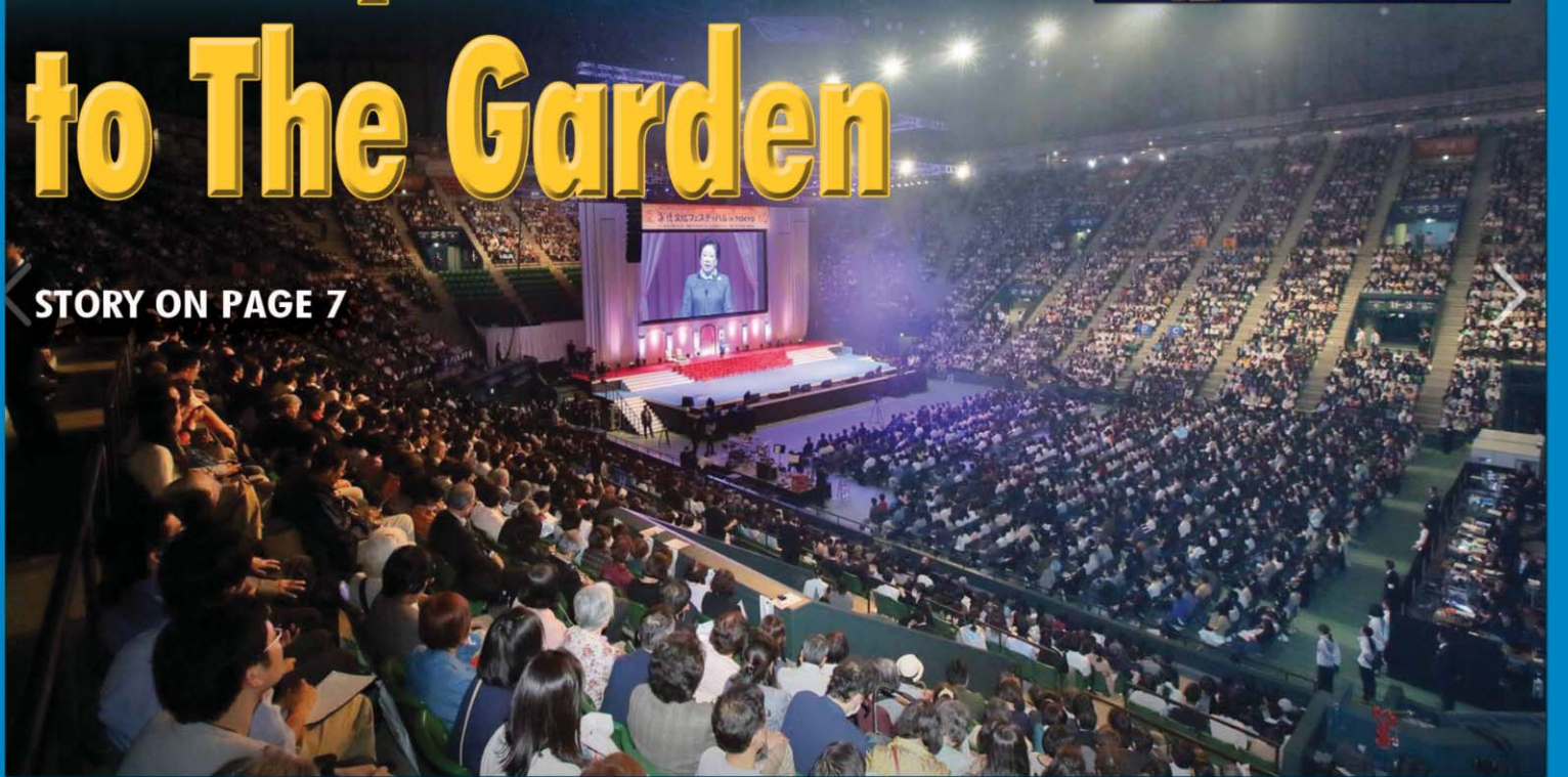
Rev. Dr. Hak Ja Han Moon speaks to tens of thousands in Japan