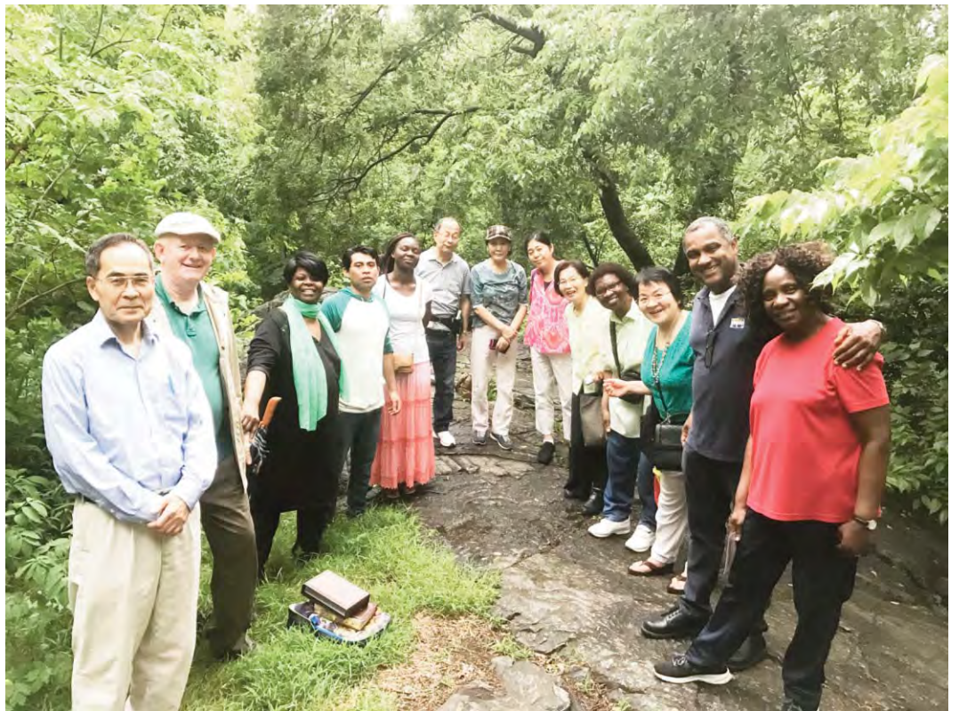
In preparation for the Madison Square Garden event, members of the American Clergy Leadership Conference gather in Central Park for prayer.

Stallings made national headlines back in 1990 when he appeared on national television on The Phil Donahue Show and