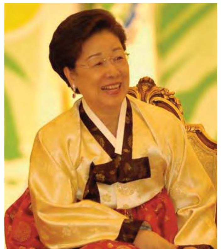
REV. DR. HAK JA HAN MOON