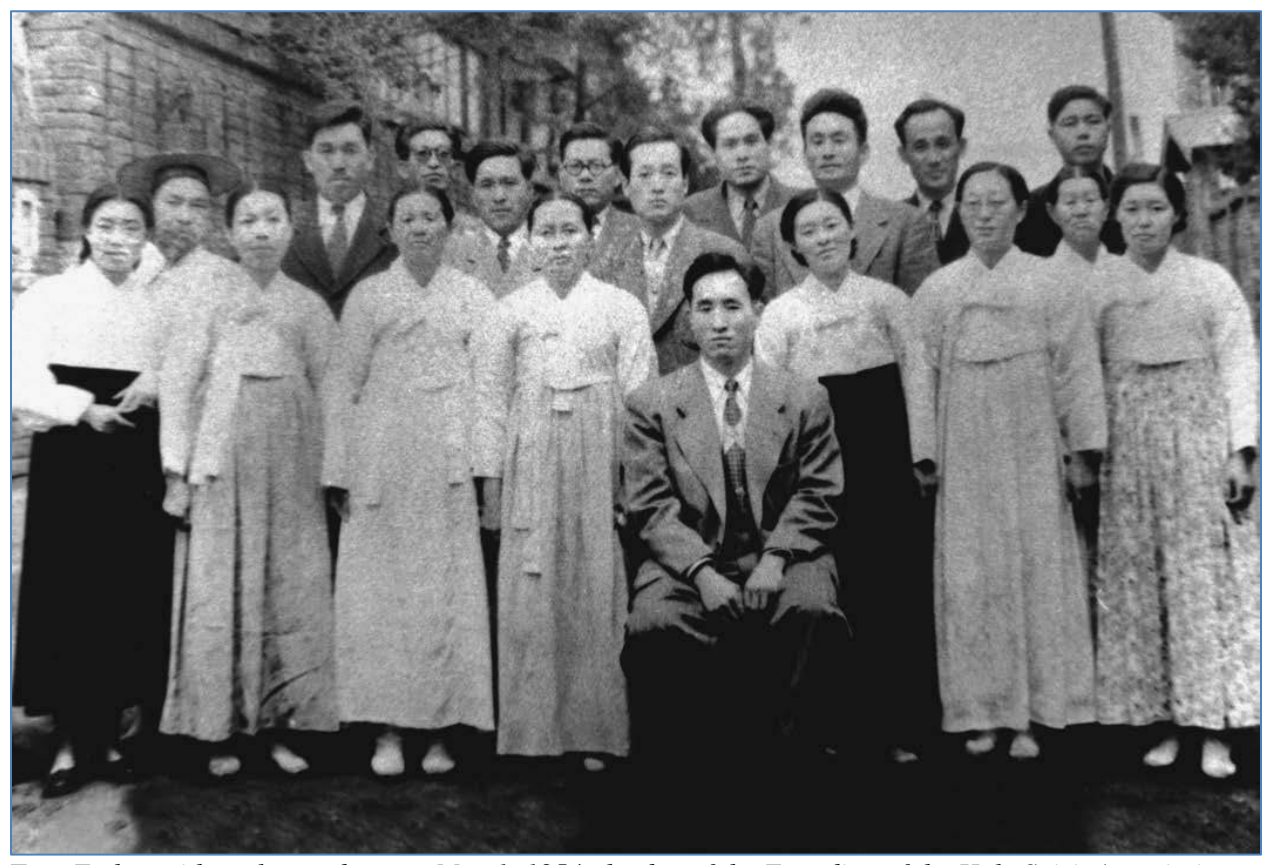
True Father with early members on May 1, 1954, the day of the Founding of the Holy Spirit Association for the Unification of World Christianity.

The world of love that God is hoping for cannot be realized without absolutely achieving this standard of love. The world of love, the final goal, must be established through individuals whom God can love, through the family composed of such individuals, through the tribe composed of such families, through the society composed of such tribes, and through the nation composed of such societies. Without having that kind of loving foundation as a base, the world cannot be bound together in love. This surely has to happen in the course of history.