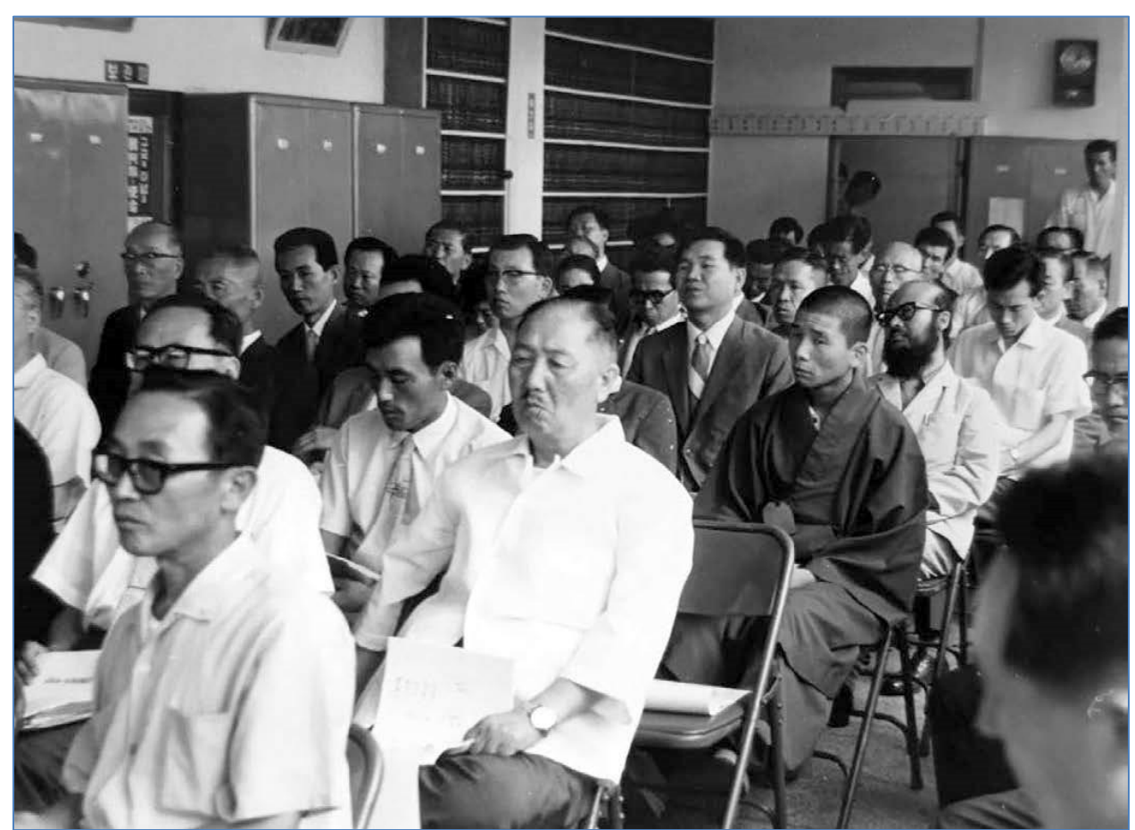
July 15, 1970 - Unification Church Headquarters in Seoul to members of the Association of Religions in

So the saints established the standard for binding the human way to the foundation of heavenly law. However, only teachings that transcend the boundaries of the world can be called the teachings of the saints. Based on these ways, human beings today have established the way of humility and morality.