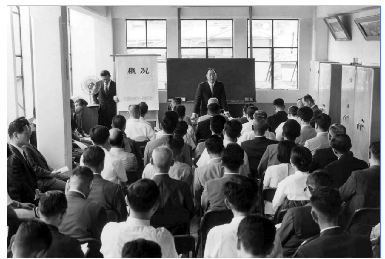
July 15, 1970 - Unification Church Headquarters in Seoul to members of the Association of Religions in Korea

Unification Church Headquarters in Seoul to members of the Association of Religions in Korea