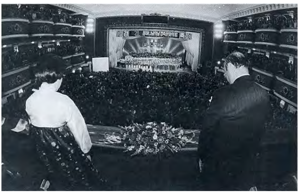
Father and Mother greet the audience at the True God's Day entertainment program in the Little Angels School in Seoul, Korea, on January 1, 1995.

evil and it seeks to pull down good people.