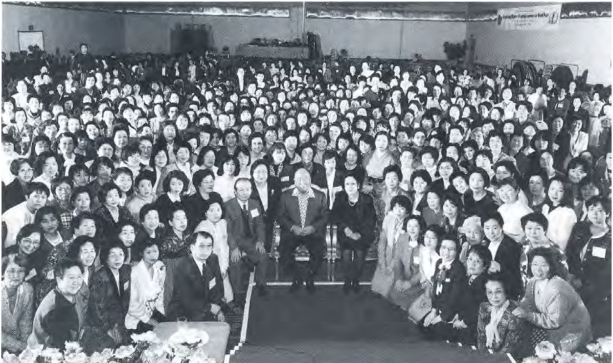
True Parents (seated center) pose with the Japanese women during an International Women's Friendship Conference for World Peace in Washington, D.C.

Why does God's providence of restoration take such an incredibly long time? Because the elder son always persecutes and tries to assassinate the younger son. Finally, he is conscience-stricken; then he apologizes and gives everything to the younger brother.