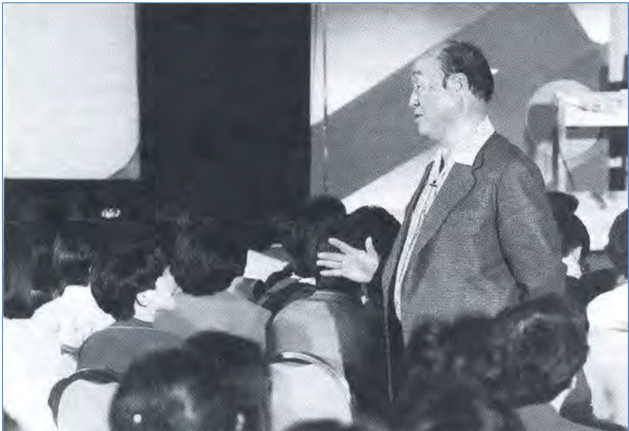
Leaders' Conference Instructions

Pride and arrogance destroys everything. I was in the lowest position, but I always make bigger and bigger plans. I am just in a servant position. We must go over the satanic world. You need to know that the formula for restoration starts with the family. Re-creation follows the same formula.