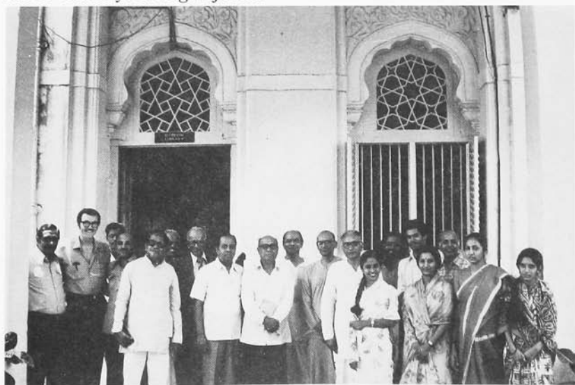
MYSORE: The Seminar Group photograph.