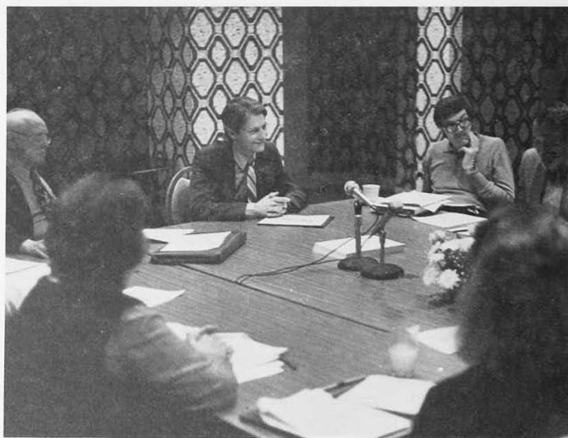
The Executive Committee Meeting of the GCWR in New York City, February, 1982.