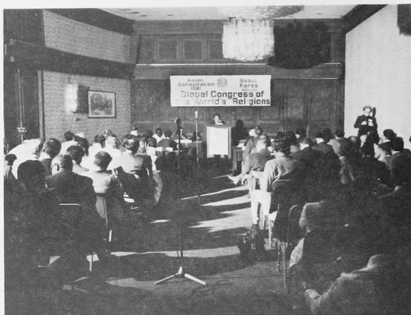
SEOUL: The audience on November 11, 1981.