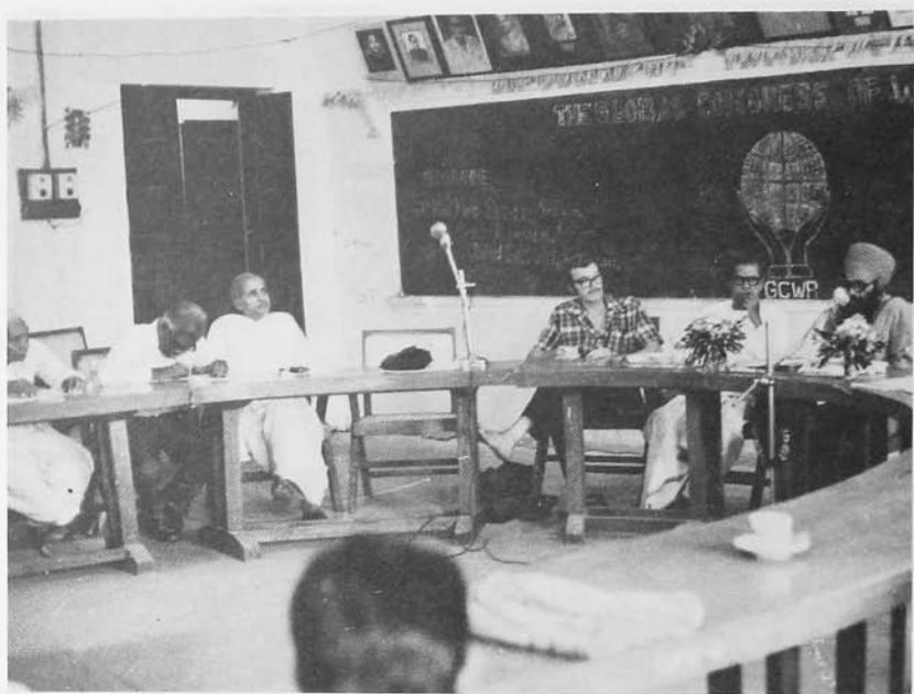
VARANASI: "Religion: Today and Tomorrow."