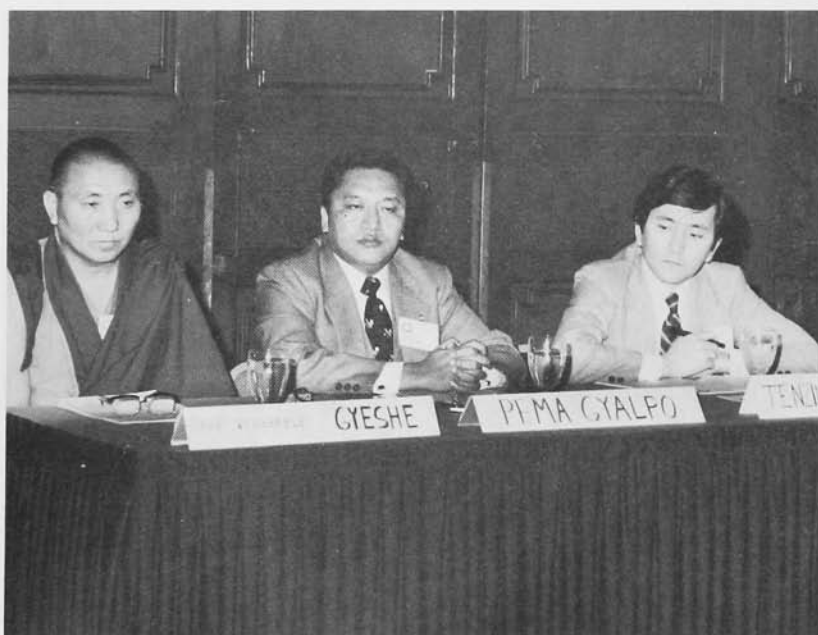
SEOUL: Representatives of His Holiness, The Dalai Lama.