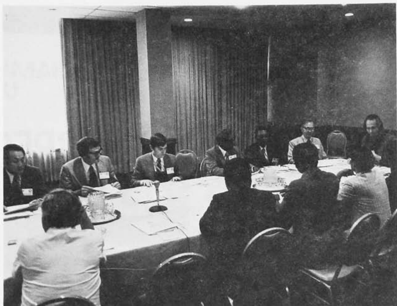
MIAMI: The Trustees meeting before the Inauguration.