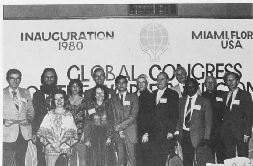
MIAMI: A high moment—after years of planning, the GCWR has been officially inaugurated.