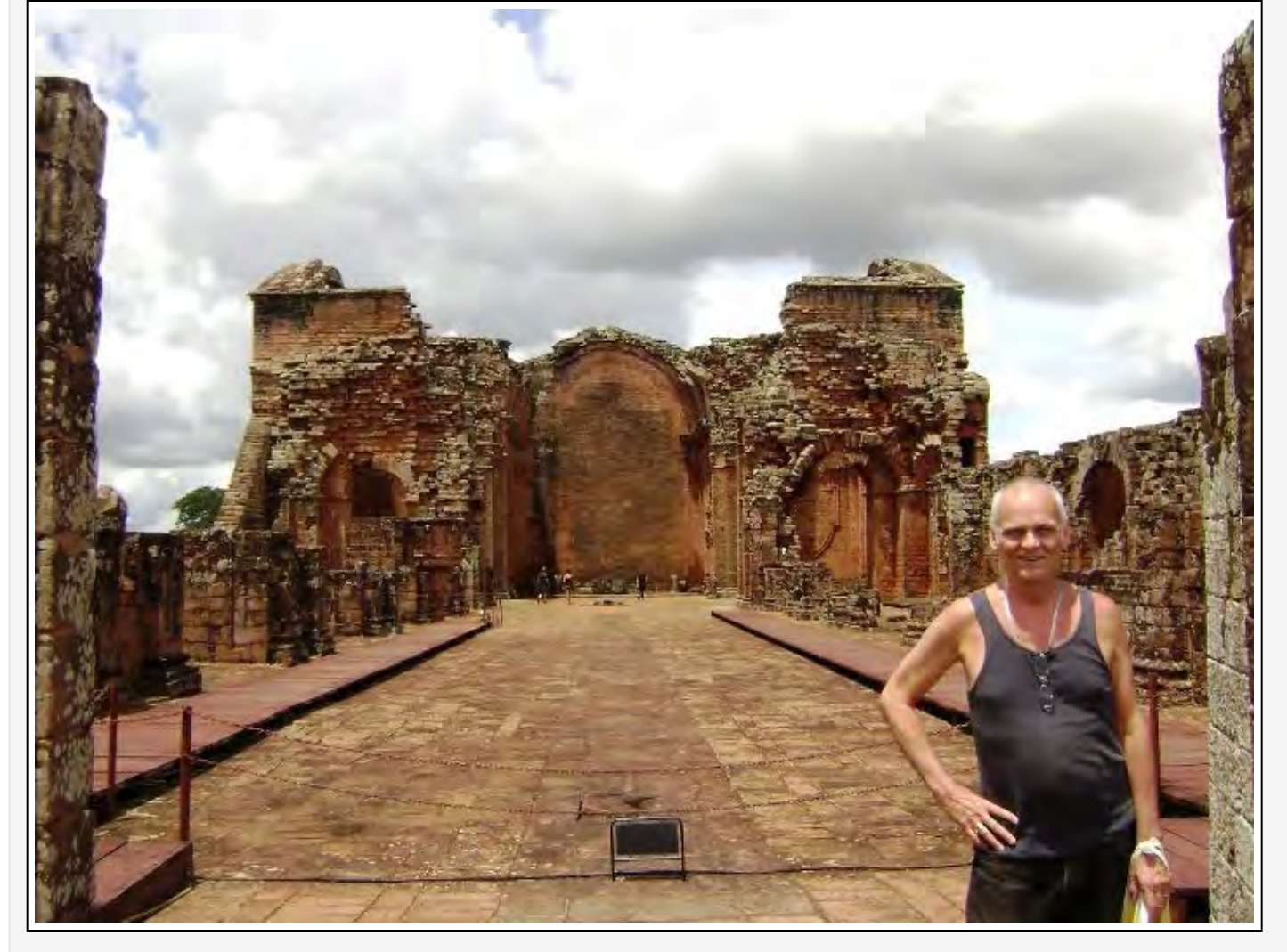
Photo: Author at the ruins of La Santísima Trinidad del Paraná Jesuit Mission

Today the ruins of the central church loom at the far end of the square. Its base, 278 x 141 feet in size, is three-fourths the size of New York City's St. Patrick's Cathedral. It was crowned by an 80-foot high central dome designed by Italian architect Giovanni Battista Primoli (1643–1747). On the right side of the church was housing for the 12 priests, and beyond that were workshops where carpenters, blacksmiths, wagon makers, musical instrument craftsmen, clockmakers, sculptors and other skilled workers labored. The mission had a philharmonic and a 200-child choir. The mission foundry produced many of the iron and bronze bells for South America. There was also a second smaller church as well as an orphanage and a house for widows. Surrounding the town were the fields and grazing lands that supported the settlement.[5]