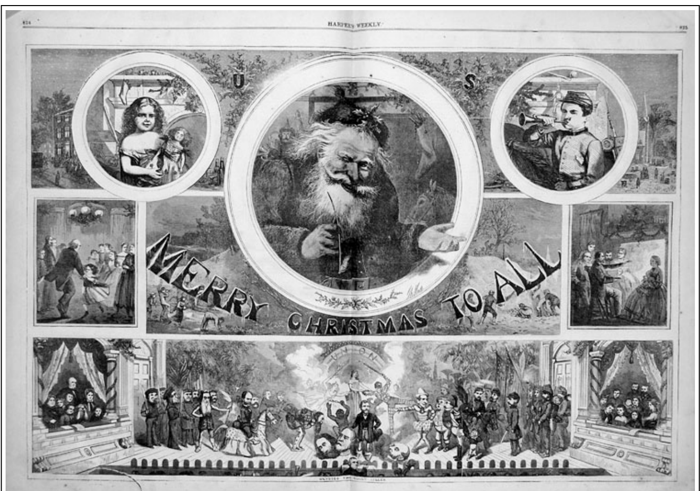
Image: This Nast centerfold depicts the various ways Christmas was being celebrated after the Civil War.

The growing American public school system in the 1880s and 1890s mobilized Santa and Christmas as a quasi-national holiday. Students were required to decorate the school Christmas tree, participate in pageants, bring gifts to exchange, and as homework describe their family celebrations. The celebration of Christmas, like speaking English, voting, and hard work, had become a test of assimilation, Americanization, and loyalty to their new nation for the millions of Italians and Eastern European Catholics, Orthodox and Jews who flowed through Ellis Island. [19]