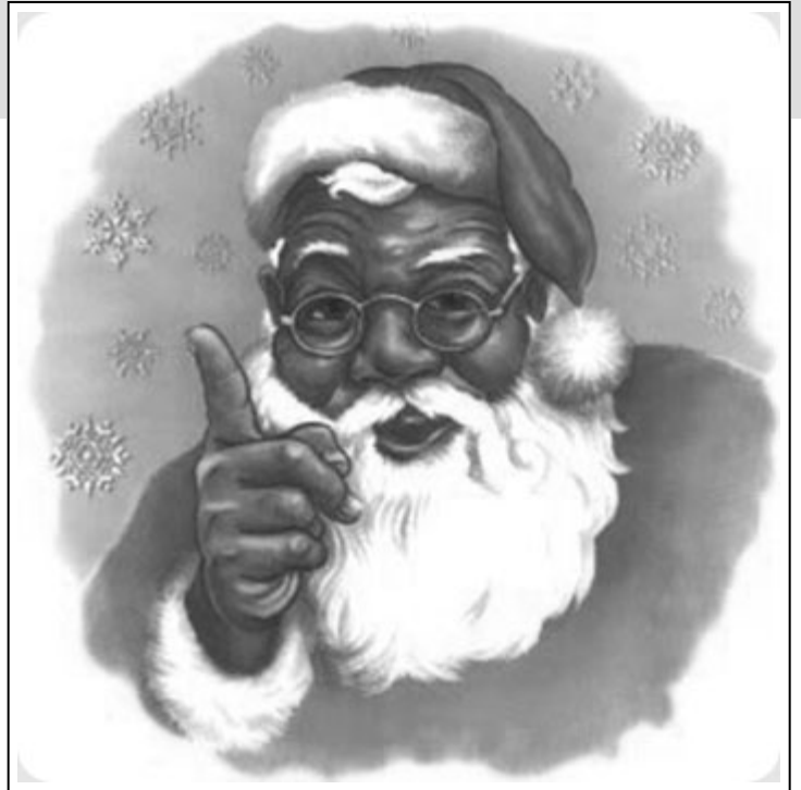
Image: Blumstein department store in Harlem was the first to feature a black Santa.

African-Americans, who were largely of the Baptist, Methodist (AME and AME Zion) and independent churches, were likewise drawn into the Christmas craze and made their own unique contributions to the season. In the 1930s Harlem had become a Black mecca, yet Blumstein Department Store on 125th Street in the heart of Harlem refused to hire any Blacks. In 1934 The Reverend Adam Clayton Powell Sr. and his son organized a march against the store, and eventually the store not only agreed to hire Blacks but featured a Black Santa, claimed to be the first in the country. [49]