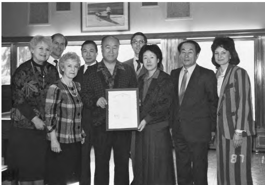
Barrytown, New York, 1987. Reverend and Mrs. Moon (center), founders of the Unification Theological Seminary are holding a certificate of accreditation from the Commission on Higher Education of the Middle States Association of Colleges and Schools.