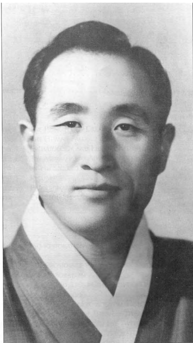
Sun Myung Moon