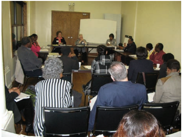
Breakout Session of the conference; participants discussing on marriage and family (3/15/08)