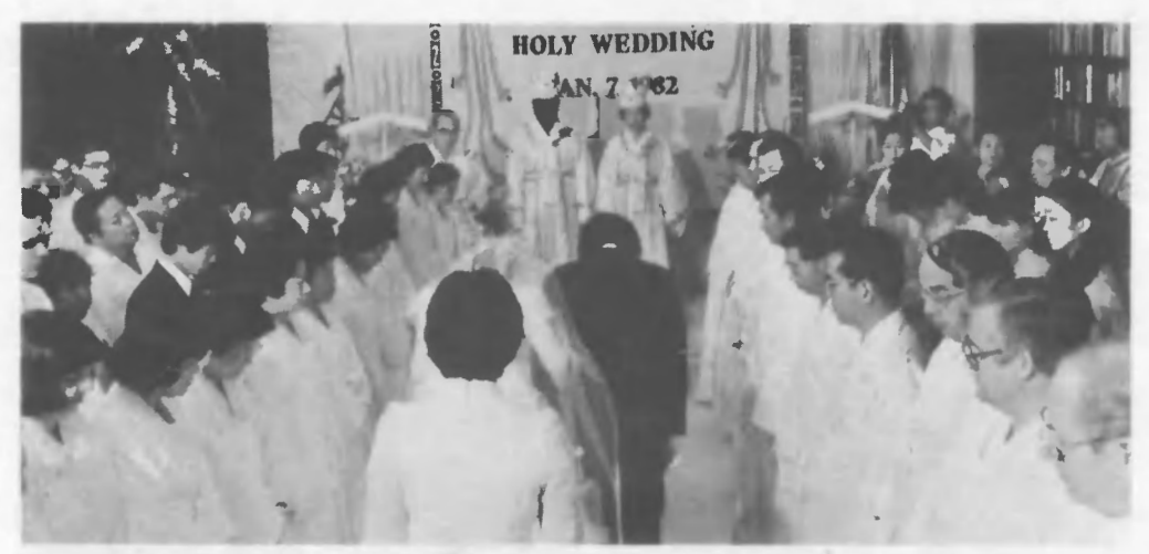
The ceremony begins