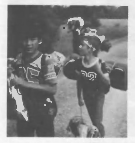
Going on a camping trip

experience for the staff. Through serving the blessed children they could really share Father's vision and hope for the future. There is great hope that 1982 will be able to produce another Camp Sunrise to which all school-age blessed children can be invited. The size of the camp depends on the number of staff members who can help. For the mothers it was a tiring but very rewarding experience.