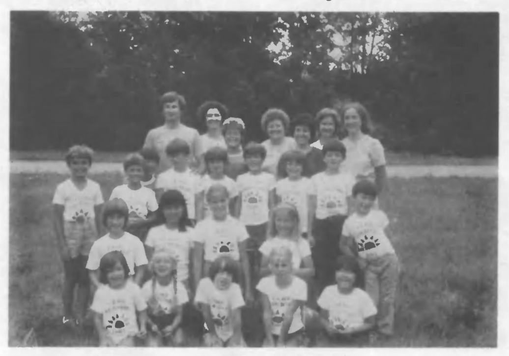
Campers and Staff of Camp Sunrise

help everyone have a good time." Holy Songs and Korean words and phrases were studied. The children were given a choice of activities -yoga and exercise class, kickball, swimming instruction or tennis. Al-