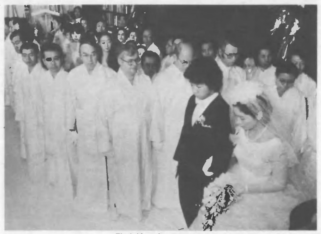
The bride and groom enter