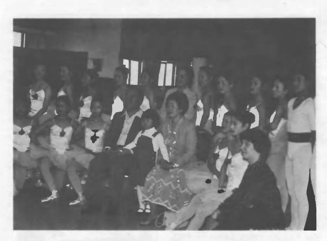
Father and Mother at the Little Angels School

Just recently a theater was built adjacent to the school, having a large stage and a special fountain with colored lights. The theater was opened in conjunction with the Tenth Conference on the Unity of the Sciences in November; over 700 academicians attended its gala premiere.