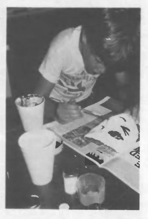
Arts and crafts