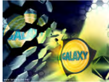
LA Galaxy 'We'll test ourselves'

Meanwhile, the Rev. Moon's Il Hwa Seongnam added a 5th national title late last year and staked a further claim to be Korea's top club team as well as one of Asia's best.