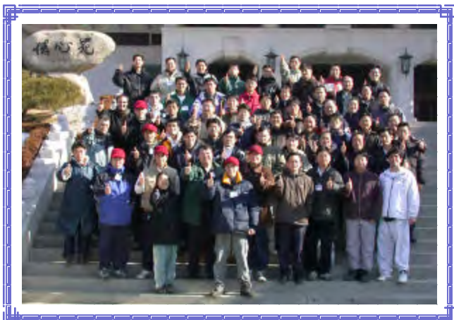
World CARP Staff in Korea

But one dizzy week earlier this month, World CARP volunteers