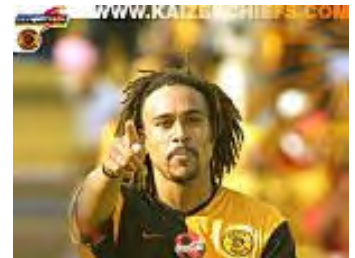
South Africa's Kaiser Chiefs, Africa's Club of the Year in 2001