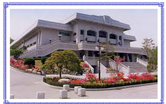
Top: The Little Angels Performed for us in Korea Bottom: The Main Temple at the Chungpyung Retreat Center