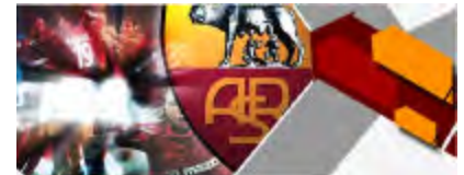
Francesco Totti in action recently for AS Roma