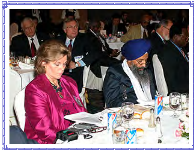
Scenes from the recent World Peace Summit in Seoul