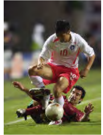
Lee Young-pyo breaks into the European Leagues