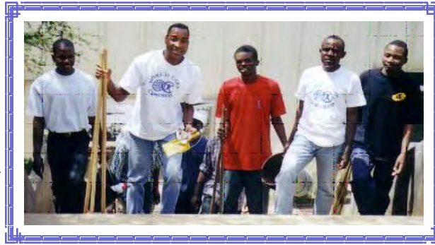
Service Volunteers in the Cameroon

The Way of Service, held this January at the University of Yaounde was another opportunity to do service work in the University Campus and to inspire students to become involved in our service projects. It is not easy to overcome the mentality of not being willing to cooperate in benevolent activities, but each time we are getting a little warmer response.