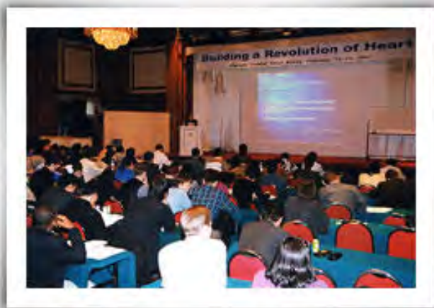
Scene from the 2002 Conference

These sessions are scheduled for eighty minutes. Presentations should be sixty minutes in duration to allow time for discussion afterward. Your presentation needs to be aligned with the theme, "Creating Transformation Toward a True Culture of Heart." On top of that, the presentation needs to support the two goals of W-CARP: increasing membership through systematic education and developing our outreach to the campus.