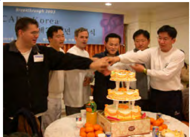
Celebrating the 37th Anniversary of CARP Korea during the retreat.

God told me over and over again 'Just forgive, and forget that these hurtful experiences ever happened. It's not all that difficult; it just requires deciding that you're going to throw them away, no matter how beautiful and valuable they may look to your fallen nature. Only in this way can you practice true love.'