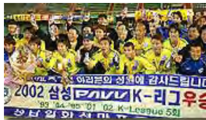
Korea's Il Hwa Seongnam Celebrate 5th Title