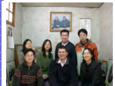
Media Team visits HeukseokDong