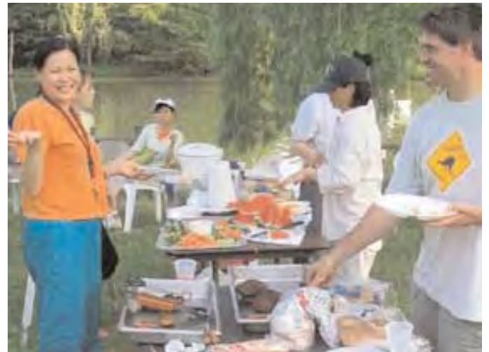
"Picnic to celebrate the opening of the Theodore Roosevelt Trails"

We encourage everyone to visit the UTS campus, to walk these historic grounds, to have a picnic by the pond, and enjoy God's creation. We also welcome any ideas or suggestions as to how we can further serve the community.