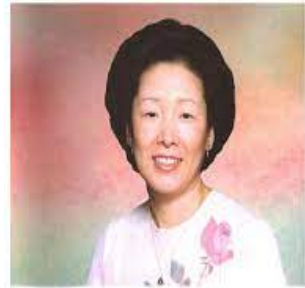
True Mother Ja Haeng Moon: An Anthology 1 Global Unity through