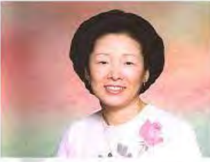
The Mother Han Moo: An Anthology 1 Global Unity through

My esteemed women leaders! Women are the individual embodiments of truth representing one of the two natures of the incorporeal God, who possesses yin and yang in both external form and internal nature. Therefore, women are not in a competitive relationship with men, who represent the other side of God. Women are not the assistants of men; they are interdependent partners who make the world whole. When God created men and women, God established them as ideal counterparts for each other and made it so that they can become one through true love. From the perspective of true love, women are the perfect object partners of the love of men, and in regard to their value, men and women are absolutely equal. The fact that the natures of men and women are different does not pose a problem. Those differences are factors that bring on the stimulation of love. In the original ideal, a man and a woman united in true love have the right of equal position and equal status.