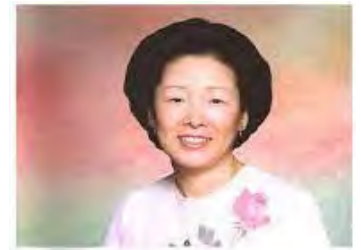
True Mother Hak Ja Han Moon: An Anthology 1 Global Unity through

In fact, in today's families, many children do not trust their parents, spouses do not completely trust each other, and brothers and sisters do not trust each other fully. Furthermore, students do not trust the teachers in their schools, and people do not trust the leaders of their nation. So the question is, how can we attain the true standard of even one of these three most important roles of parents, teachers and leaders? When I say that you need to become a true parent, true teacher or true owner, who do you think has the highest standard or is the central model for those three positions? God does. And God is the True Parent among parents, True Teacher among teachers, and True King among kings. God is the eternal True Parent, eternal True Teacher, and eternal True Owner and King. If we are children of God, we need to become true parents first, just like God. In addition, we have to follow the way of the true teacher and the way of the true owner, just like God. This is the concept of the “three subject partners.” The ultimate model is God.