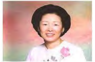
True Mother Hak Ja Han Moon: An Anthology I Global Unity through

This evening, I would like to share a new speech titled, True Family and True Universe Centered on True Love . Everyone here has parents and teachers, and you also have leaders in your nations. Am I right? Everyone undeniably needs people in these positions. However, compared to the true standard, there are many different types of parents. What do you think? To what extent have you, yourself, become a true parent? In the same way, if a person is a professor at an Ivy League university such as Harvard, Yale or Columbia in the United States, or at Oxford or Cambridge in England, does it mean that he or she can be called a true teacher? Similarly, there are different types of leaders in a nation, not all of whom measure up to the true standard of leadership. Does the bare fact that someone is president of a superpower such as the United States mean that he or she is a true president?