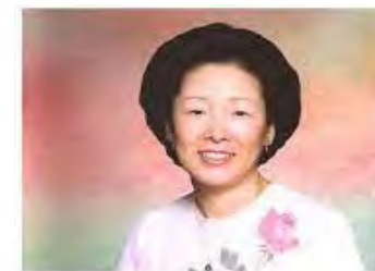
10 The Mother Hak Ja Han Moon: An Anthology 1 Global Unity through

What is the difference between a man and a woman? Their bodies are different, including their reproductive organs. Then for whom is a man's reproductive organ absolutely necessary? A man's reproductive organ exists for the sake of a woman. The human reproductive organs are shaped as concave and convex. Why are they shaped that way? Both could be pointed or both could be flat. Why are they shaped differently? Each is for the sake of the other. A woman absolutely needs what is part of a man's body, and a man absolutely needs what is part of a woman's body. Until now, we did not consider the fact that a woman's reproductive organ absolutely belongs to a man, and a man's reproductive organ belongs to a woman. By owning each other's reproductive organs, man and woman come to know true love.