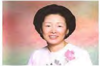
True Mother Hak Ja Han Moon: An Anthology I Global Unity through

Consider our five senses. Did God create my eyes to look at my eyes? He created my eyes, nose, ears, mouth and hands for the sake of my object partners. The force that mobilizes and focuses all five senses is true love. God created our eyes, nose, ears, mouth and hands for true love, that is, as instruments for relationships of true love. God created nothing just for myself. On the contrary, a person who claims that what belongs to others is “mine” is called a thief. If someone takes what belongs to others for personal use, isn't that person a thief? Therefore any man who uses his body, including his five senses, for himself alone is a thief, because they actually exist for the sake of a woman.