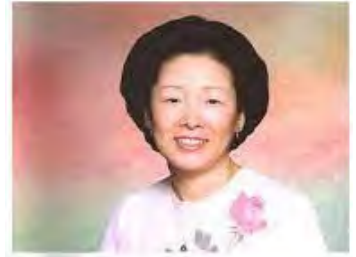
True Mother Hak Ja Han Moon: An Anthology of Global Unity through

First, we need to know God. Second, we need to know our eternal life. Third, we need to know true love. True love means giving more than 100 percent of oneself. In this way, we can find eternal life. Without true love, there is no eternal life. Without eternal life, we cannot meet God. How can you prepare for the world of the future? First, be altruistic. Second, practice true love. Third, seek eternal life. With the sincere practice of these virtues, we can manage the world in the coming age. The opposite way is the self-centered way of life, which is the worldview of Satan. In contrast to Satan's love, what is true love? True love is to invest beyond the point of your life and death. Without investing yourself beyond the point of life and death, there is no true love. I would like you to know that I have poured my life, my heart, and the resources of our church into America. Through this kind of practice, true love is actualized. Without actualizing true love, there is no eternal life.