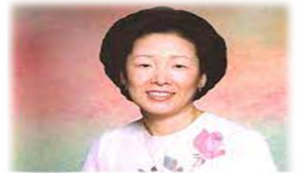
True Mother Hak Ja Han Moon: An Anthology I Global Unity through True Parents

Distinguished guests; youth representatives from 164 countries; students, ladies and gentlemen. I would like to express my warmest appreciation to you for participating in this inaugural meeting of the Youth Federation for World Peace. I am delighted to meet all of you in this beautiful capital city to discuss the important issues that are before us.