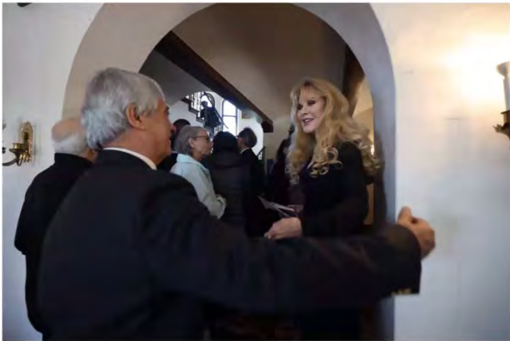
Rebecca Holden (Actress and Singer)