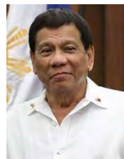
Pres. Rodrigo R. Duterte

Manila, Philippines—On June 25, 2020, Philippines President Rodrigo Roa Duterte signed the Republic Act 11476, which reintroduces and institutionalizes character education in Filipino schools, public and private, from elementary to high schools, spanning grades K to 12. The government agency that will lead the implementation is the Department of Education. The Act is a consolidation of two separate bills: one passed by the Senate and another by the House of Representatives in March of this year. Officially it is known as the "GMRC and Values Education Act," wherein