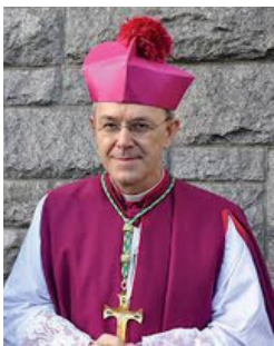
Bishop Athanasius Schneider

Thu. Oct. 10, 2024 - (LifeSiteNews) — Bishop Athanasius Schneider warned during a Tuesday interview with Candace Owens that modern “elites” are using pornography to enslave children. Owens remarked that American schools teach students that watching porn is “healthy,” to which Bishop Schneider replied, “Pornography is one of the most dangerous spiritual poisons. So they are giving poison to our children. This is criminal.”