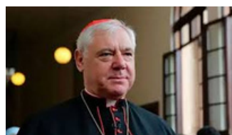
Cardinal Gerhard Müller