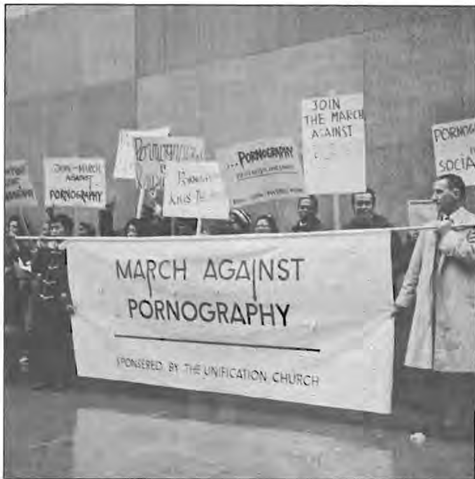
International Family Association regularly sponsors anti-pornography rallies in New York.

When the association was formed last summer, members immediately began giving out tickets for Madison Square Garden and hanging posters in areas that the regular team didn't cover, like some parts of New Jersey.