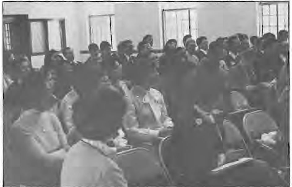
Gathering of international missionaries at Barrytown.