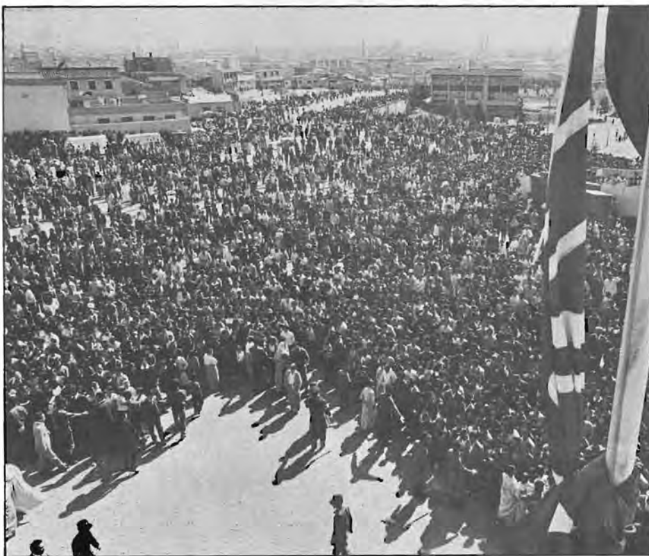
(Cover) Crowds outside hall at Taegu. This was but a portion; the crowd fanned out in the large area in front of the hall, as shown in this photo taken earlier (below left). (Above) Many waited like this for hours in Taegu. (Above left) The crowd at Pusan began gathering in the early afternoon.