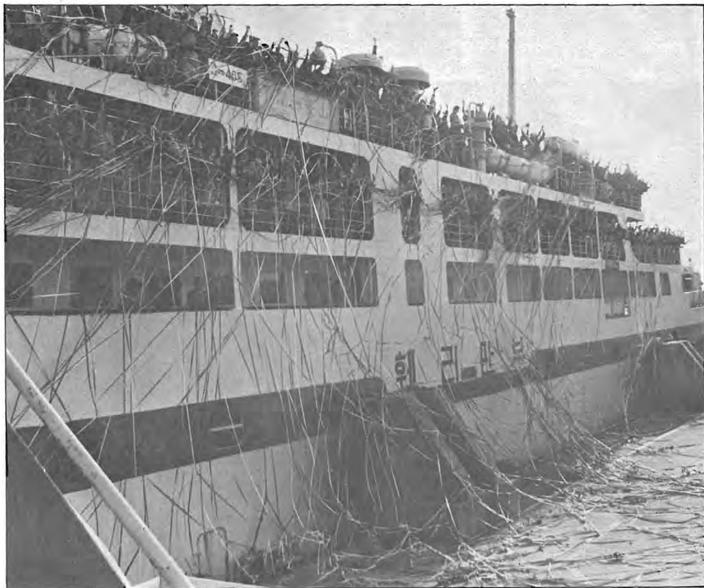
(Above) Ferry carrying Global team leaving Japan on March 26 for Korea

now the international worldwide scope of our movement is being proclaimed as the Global team has brought success after success. Especially significant is the fact that large crowds have come to two of the cities—Pusan and Taegu—where Father experienced bitter persecution at the beginning of our movement twenty years ago. In Pusan, Father closed his speech by recalling and condemning the way he had been treated previously. In Seoul, after a group of Christians sponsored a newspaper ad against our church, he responded by placing an ad in seven newspapers proclaiming the achievements of our church, announcing that after all of these years, unjust accusations must cease.