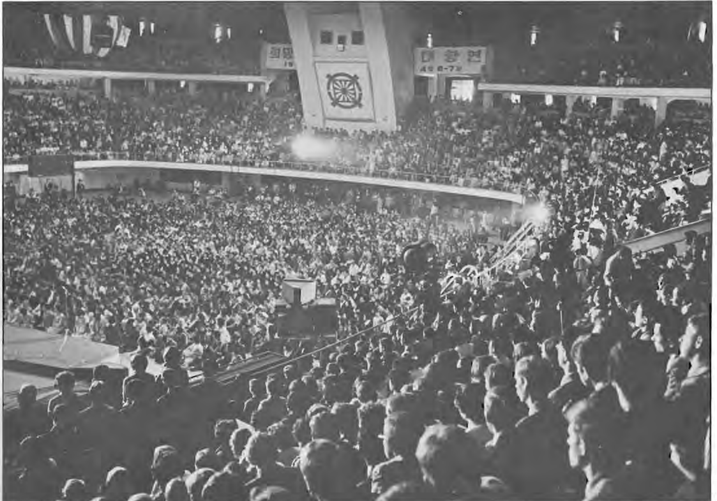
Taegu: Inside the hall. As seats filled, people sat on the floor.